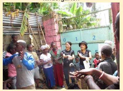
Handwashing awareness activity at a NGO