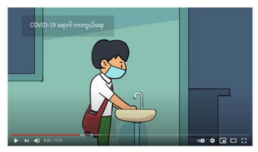
< Awareness message for teachers >

Since March 2020, elementary schools have been closed due to the spread of COVID-19 infection, so handwashing activities have been stopped at schools now. On the other hand, as part of the project activities, we are making an <u>educational video for teachers and parents</u> on how to prevent COVID-19 infection among children, including the promotion of handwashing, which will be aired on TV after school reopens. The video is currently available on the project's Facebook page.