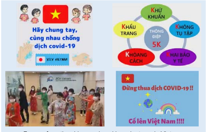
Frames from the video produced by volunteers in Vietnam

We would like to take this opportunity to introduce you to some of the volunteers who have produced and released awareness raising videos while in Japan. If there is a video from a country that you are connected to through your work, please watch it and help us spread the word about our activities through various opportunities.