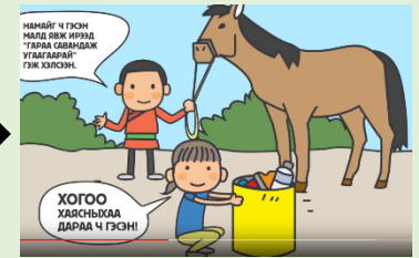
Boy's clothing and animal (cow to horse)