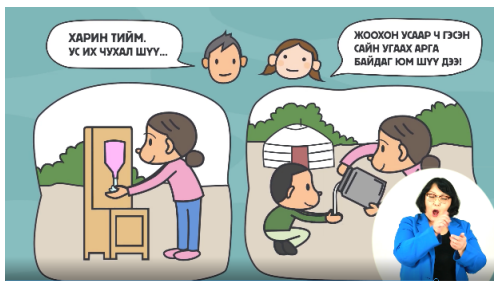
Animation video "Let's wash our hands together"

The animation includes a child in a wheelchair and a sign language interpreter. The content of the handwashing method is also adapted to the Mongolian situation.