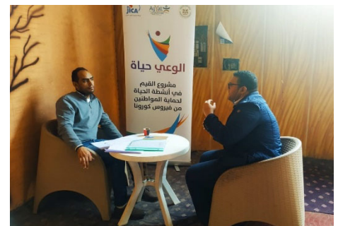
Recruitment of youth leaders is also underway.