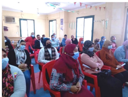
Orientation sessions are being held at youth centers around the country.