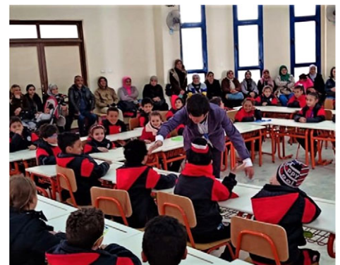
JOCV has also been contributing to the introduction of "Tokkatsu"

The program will last until August 2021. Approximately 1,500 children will be directly targeted, but the concept will be widely disseminated to the Egyptian public through TV commercials, posters, social media and other PR campaigns. We are also looking forward to seeing the growth of the 100 young people who are currently being recruited as leaders.