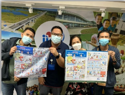
A handkerchief printed with "Correct Handwashing" prepared by the JICA Philippines office (left) and the national staff of the office