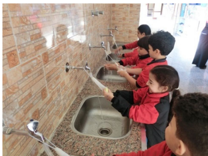
Handwashing is a common practice in Egyptian and Japanese schools.