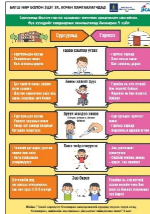
Poster outlining precautions for preventing infection at school and at home

Mongolian government has taken measures to prevent the spread of COVID-19 by closing schools even before the first cases were confirmed in the country. As of February 2021, the total number of infected people has been kept below 23,000. The children have been learning for a long time by watching TV lessons broadcasted by the Ministry of Education and Science through several TV stations, and face-to-face lessons are scheduled to resume in March 2021. In light of this situation, the project produced an animation video based on "Correct handwashing" by INOUE Kimidori and a poster summarizing the precautions for preventing infection with the COVID-19.