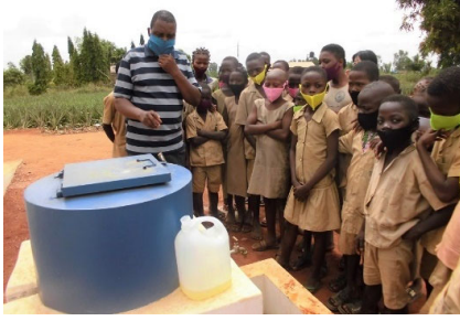
Handwashing instruction at the handwashing facility

after the actual toilet use and handwashing instruction, a post test was conducted to check the level of understanding of the knowledge. In addition, school officials were asked to confirm their plans for proper use and maintenance of the facilities.