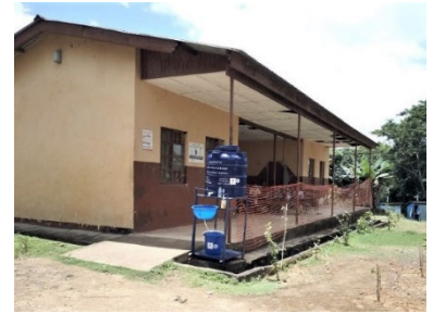
Newly installed foot pedal type Handwashing Station