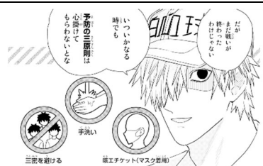
“Preventing Novel Coronavirus Infection” (Screen capture)

What happens in the body when infected with the novel coronavirus? This story depicts the battle between white blood cells, red blood cells and other cells, leading to a correct understanding of the mechanism of infectious diseases.