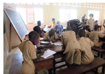
Pre and post classroom lectures