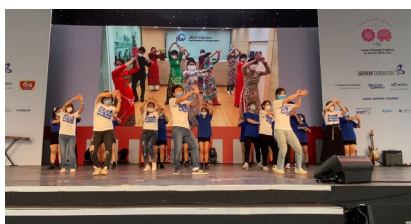
Handwashing dance by students of Vietnam Japan University and JICA staff

On April 17-18, 2021, the "7th Japan Vietnam Festival" was held in Ho Chi Minh City, Vietnam, attracting a total of 230,000 visitors. JICA gave a 20-minute dance performance on the festival's main stage with students from the Vietnam Japan University, which we have been supporting through a technical cooperation project. In the performance, they performed a handwashing dance.