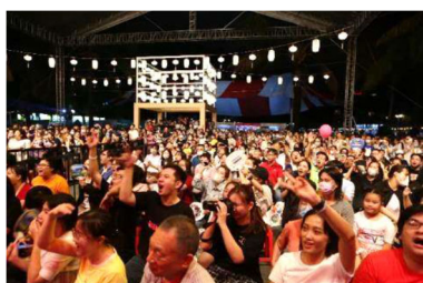
The main stage (Performance of JAPAN VIETNAM MUSIC SHOW)