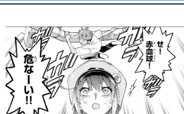
“Novel Coronavirus” (Screen capture)

■Title : Novel Coronavirus (by Akane Shimizu)