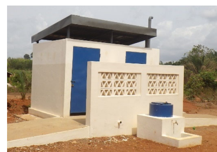
Constructed toilets and handwashing facility

For the soft component, we prepared an instruction manual for encouraging toilet use and hand washing in advance, and based on this manual, we held workshops at each school. During the workshop, a questionnaire was administered to the students in advance, and