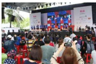
Dance performance by students from Vietnam Japan University

The JICA volunteers who made this video had already returned to Japan after completing their assignment, but JICA staff and students from the Vietnam-Japan University are continuing to raise awareness and utilize the fruits of their work.