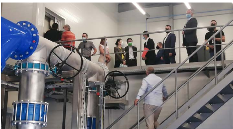
Inside of the water purification station

This Project was implemented between 2003 and 2013, based on the Loan Agreement between Government of North Macedonia, JICA and Knezevo dam when water intakes and related facilities were constructed.