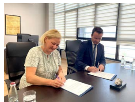
Official handover of the Agromarket KS to the Ministry of Agriculture, Forestry and Rural Development for further management of the Platform