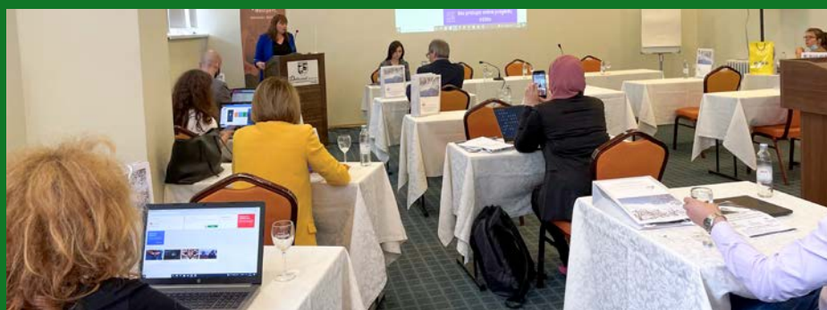
Training on the use of ICT in SMEs in Zenica

The main objective of the webinar was to share results of the survey among related stakeholders and SMEs in different sectors in BiH. During the webinar, the participants were informed about the results of the survey and they gave their opinion regarding