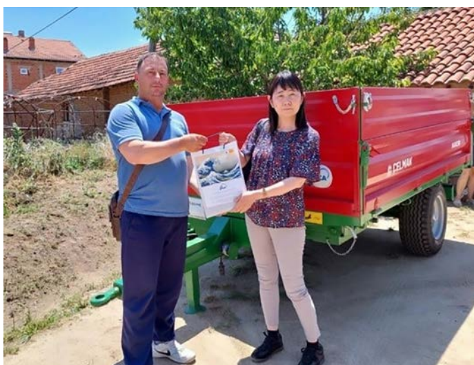
Handover of trailer and set for label printing to cereal producers in Prilep