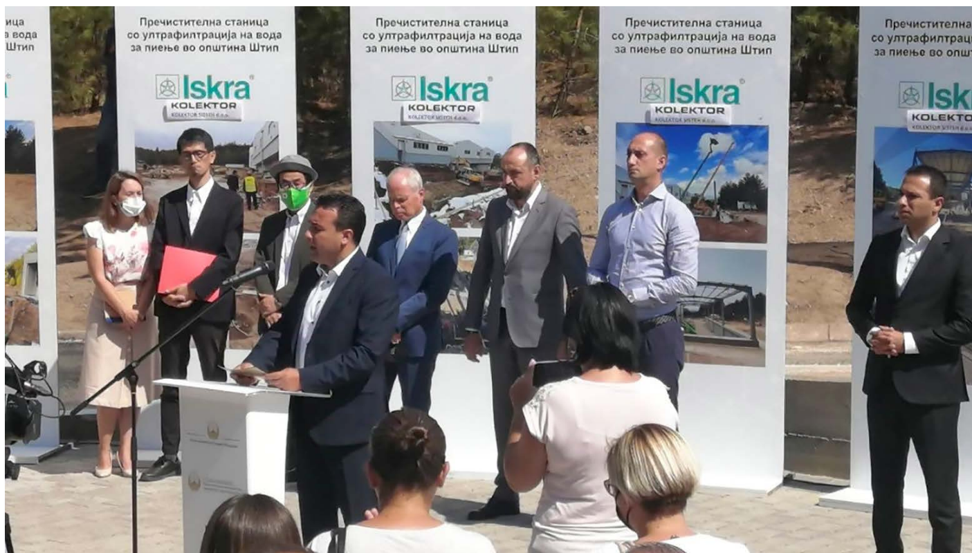
Mr. Zoran Zaev, Prime Minister of North Macedonia addressing the attendees