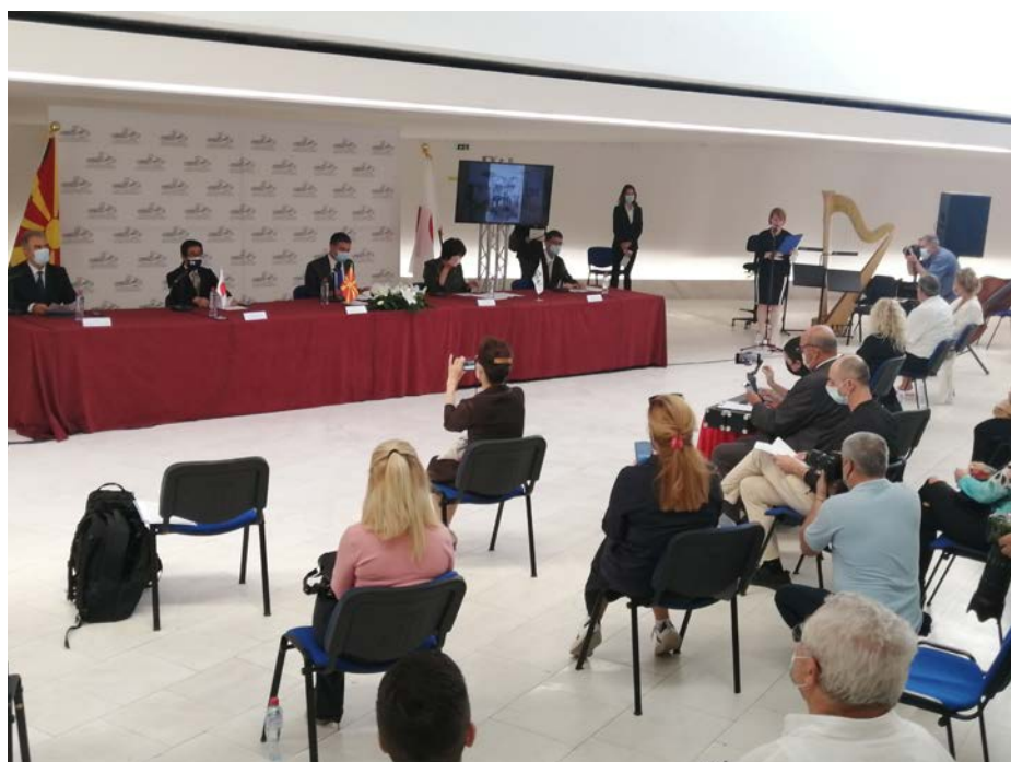
At the handover ceremony at National Opera and Ballet

Through this grant aid, Japan aims to support the NOB to improve the quality of