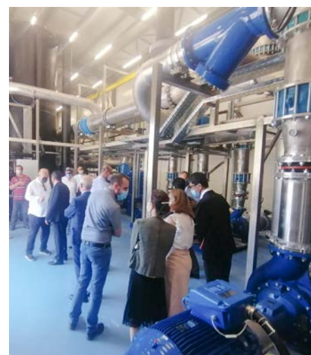
Inspection of the water purification station