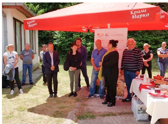
Handover of vacuuming machine, duplicator, set for label printing and fruit and vegetable milling machine in Makedonski Brod