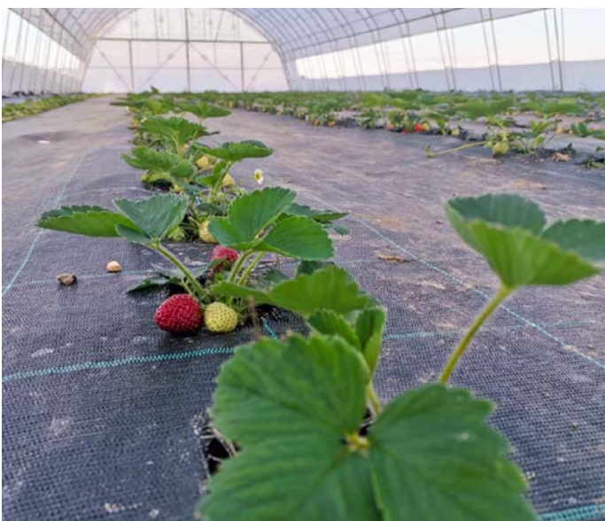
Senga-sengana strawberry grown in plastic greenhouses in Loznica