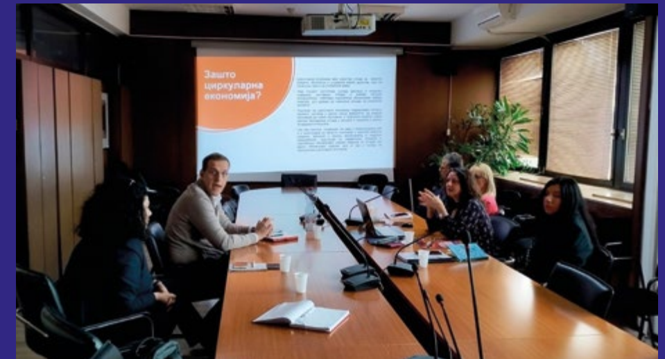
Meeting at the Ministry of Environmental Protection