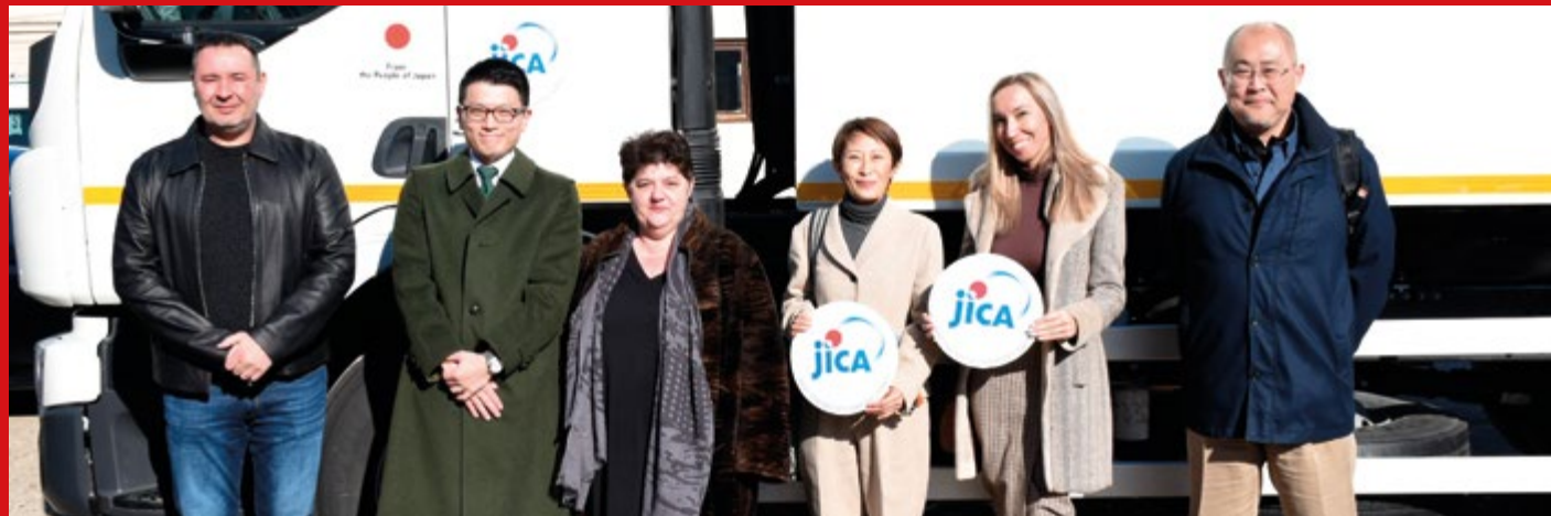
JICA project team with the counterpart

On January 31, JICA donated a new compactor truck to PUC Standard Šid. Along with the truck, weighbridge, garbage containers, composters, and a chipping machine were also donated and installed in Šid municipality to enhance the waste management system under the bilateral Technical Cooperation pro-