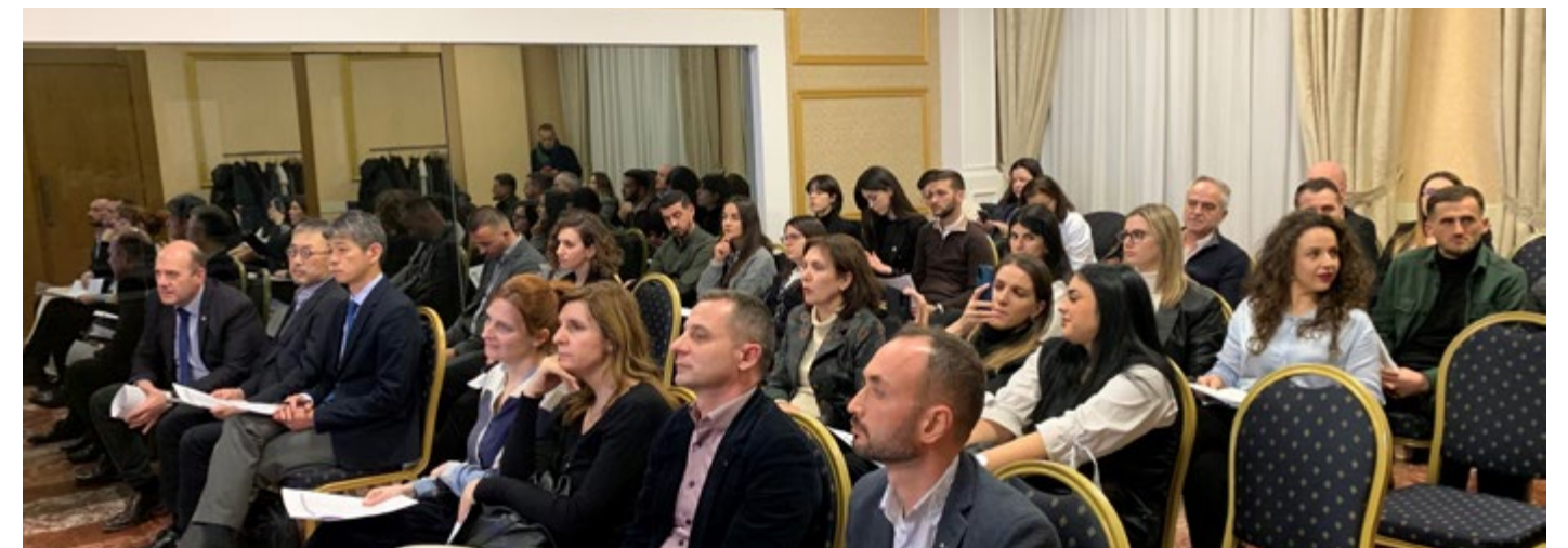
Attendees at the Thematic seminar

On January 22, JICA Alumni Association of Albania (JAAA) held a seminar in Tirana, on emphasizing the contribution of JICA Knowledge Co-Creation Program (KCCP) on enhancing the human resource capacities of the public administration in Albania. During this seminar, 8 ex-participants of JICA KCCPs who attended the trainings in 2023, made presentations on their experience in Japan,