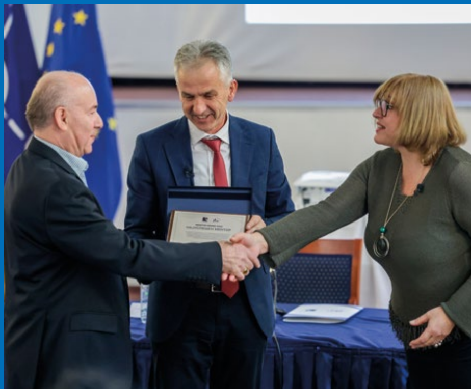
Handover of the Mentor Award