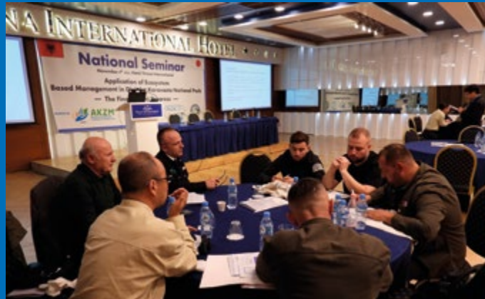
Final seminar on Project for capacity building for improving Ecosystem-Based Management on Divjake-Karavasta National Park

On November 8 and 9, the “Project for capacity building for improving Ecosystem-Based Management on Divjake - Karavasta National Park” held the Final (National) Seminar & Third JCC Meeting of the Project in Tirana. The main purpose of the seminar was to share the final progress and experience of the NAPA-JICA project and to promote understanding of Ecosystem-Based Management in Albania. More than 65 participants, representatives from the network of protected areas agencies, in national and regional level, representatives from other relevant institutions and agencies, local government, NGOs, universities and media participated at the seminar. Japanese expert team and local experts presented the results and achievements for all project components. This National Seminar concluded that the application of the Ecosystem based Management approach in DKNP is a successful model for all Protected Areas in Albania.