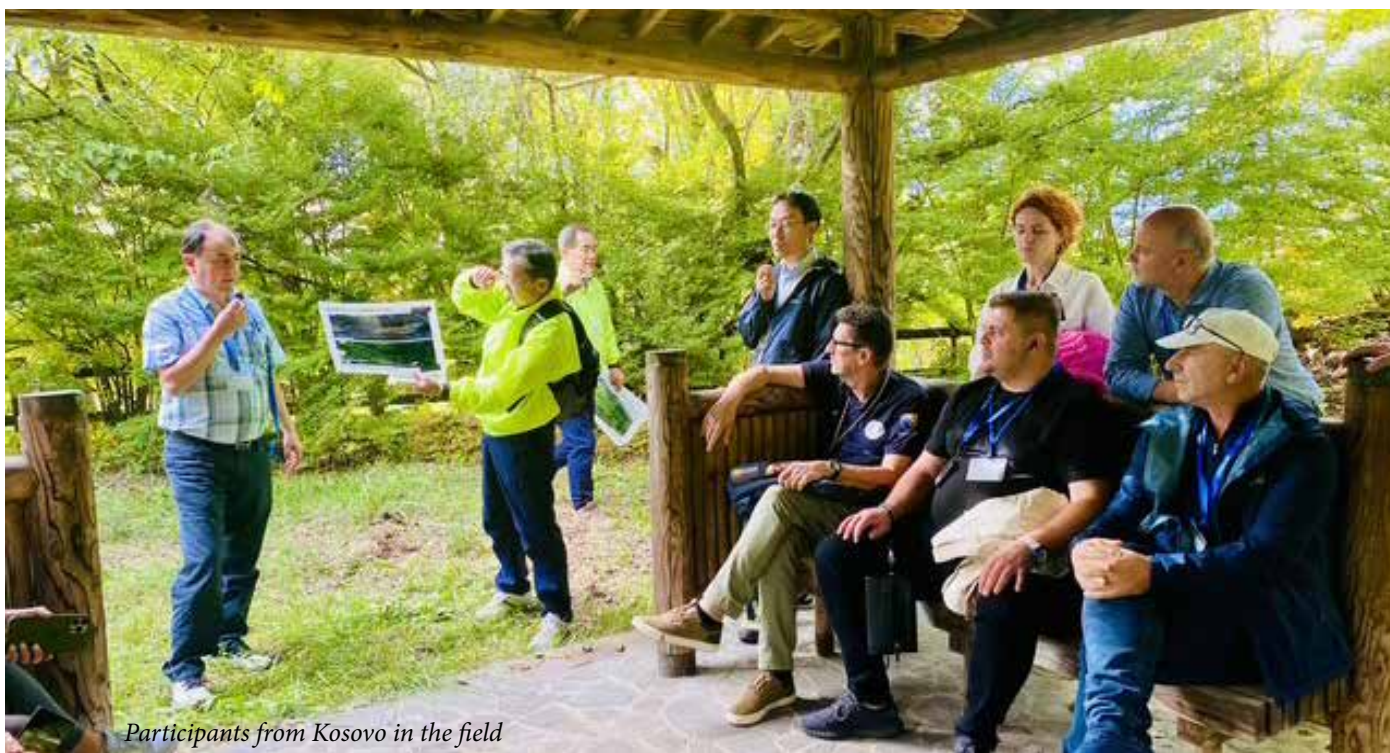
Participants from Kosovo in the field

The visit had a study and practical character with theoretical and practical presentations, field expeditions, visits to various Agencies and Institutions such as Japan Forestry Agency, Fire and Disaster Management Agency, Management of the