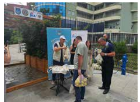
Promotion of planting trees in the center of Istog

mented continuously. In addition, based on the result of the pilot projects, the four target municipalities have analyzed their respective Waste Management Plans and have explored ways to reflect the outcomes, remaining issues, and lessons learned, and have considered necessary initiatives for further improvement in each municipality. The four target municipalities are thus well-placed to introduce a circular economy, which is the goal of the Kosovo government.