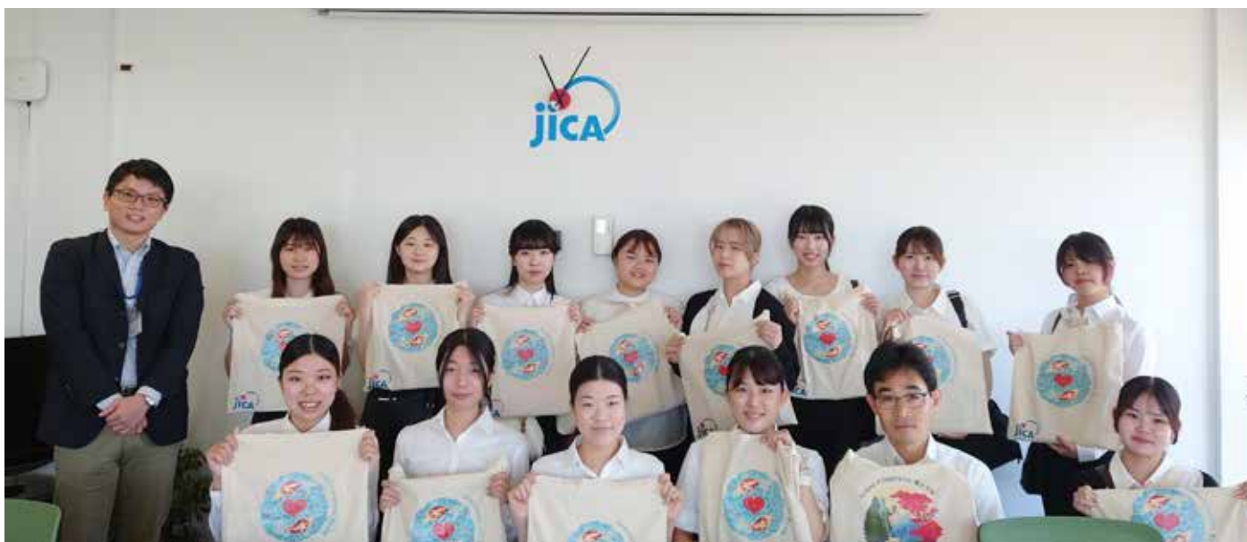
Gakushuin students visiting JICA Balkan Office

On August 29, students from Gakushuin Women's University visited JICA Balkan Office. On the day of the event, the office staff gave an overview of JICA and introduced JICA's initiatives in the Western Balkans, especially Serbia. The participating