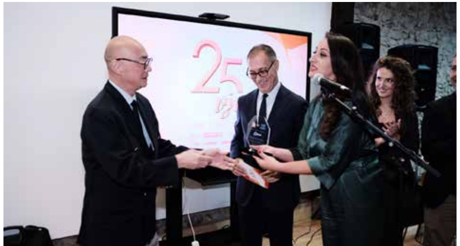
Awarding ceremony at RTK Kosovo