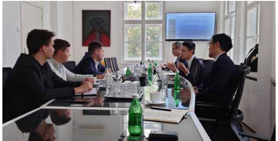
Meeting with the Ministry of Science, Technological Development and Innovation