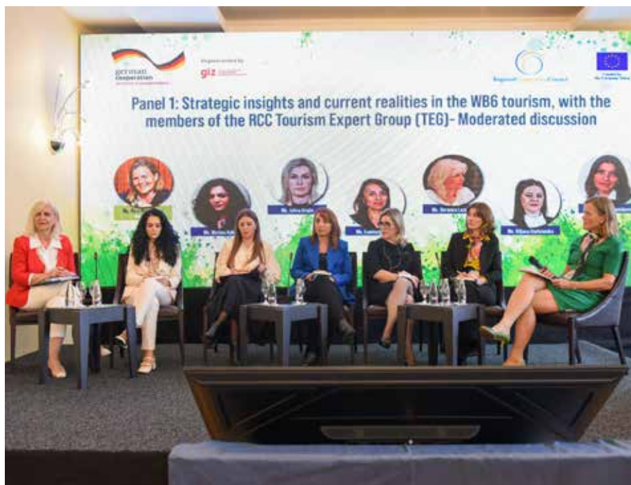
Panelists at the Conference

On October 24 to 25, the German Corporation for International Cooperation (GIZ) and the Regional Cooperation Council (RCC) organized the regional Conference “A Sustainable Future: Cooperation, Communication and Connectivity in the Western Balkans’ Rural and Adventure Tourism” in Bar, Montenegro. The event gathered all key stakeholders from the tourism-related ministries and organizations, associations and regional organizations, private sector representatives, and international organizations. Main aim of the event was enhancement of communication and connectivity within tourism sector, in order to explore potentials of the Western Balkans as a resilient, innovative and sustainable destination. This occasion was used for the exchange of the latest updates in tourism sector in 6WB economies, with the special focus on rural and adventure tourism development of the Western Balkans. Empowering women’s role in tourism, destination management system approach, securing skilled workforce, continuous development of knowledge and skills were just some of the topics in the focus of the