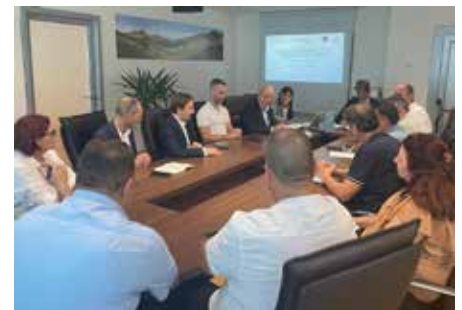
Members of JCC for Solid Waste Management Project

mented continuously. In addition, based on the result of the pilot projects, the four target municipalities have analyzed their respective Waste Management Plans and have explored ways to reflect the outcomes, remaining issues, and lessons learned, and have considered necessary initiatives for further improvement in each municipality. The four target municipalities are thus well-placed to introduce a circular economy, which is the goal of the Kosovo government.