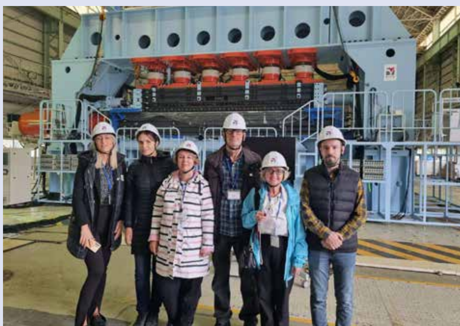
Participants from BiH during the site visit

Ministry of Security of Bosnia and Herzegovina