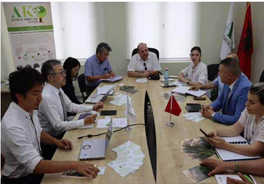
Kick off meeting