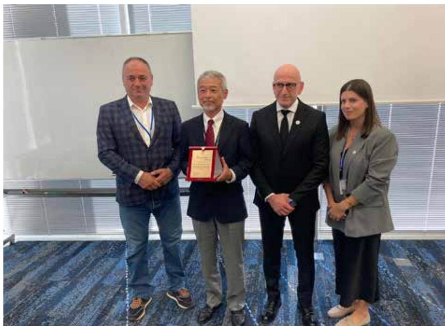
Participants from Montenegro at the Certificate awarding ceremony

This training course enabled the exchange of experience, knowledge and modalities of good practices from the aspect of science and profession on the topic of Eco-solutions and solutions based on nature, which are a relatively new approach to the prevention and mitigation of disasters in the world. These measures and solutions are also the focus of international funding sources, and projects and programs on these topics will be a follow up in the coming period. The results of this visit will certainly be the creation of concrete solutions to reduce the risk of disasters in Montenegro.