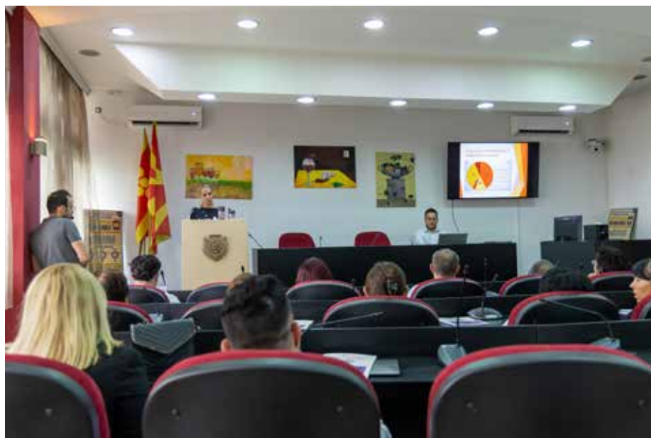
National Workshop for promotion of project results in Negotino

On June 13, National Workshop for promotion of the results of the project