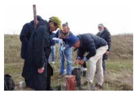
Field work by the professors

The project has successfully achieved its goals in human resource development, environmental education, and sustainable environmental practices. Plans include continued support for waste management and pollution remediation in Ponjavica Nature Park, leveraging Japanese expertise and technology.