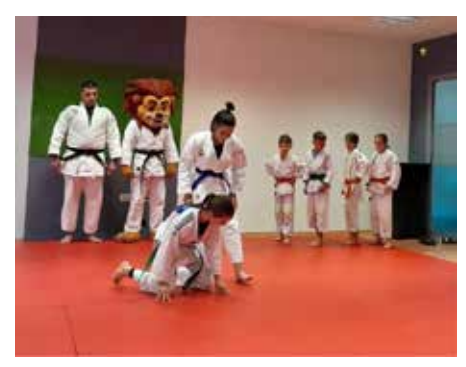
Iudo club BORSA

On December 13, Alumni BiH hosted cultural event "The day of Japanese culture in Bosnia and Herzegovina"