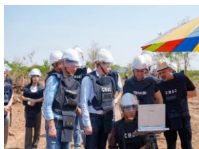
Ukraine delegates visiting CMAC minefield

This first such effort began in 2010 when JICA's counterpart, CMAC (Cambodian Mine action Center) started sharing its expertise with other mine-affected