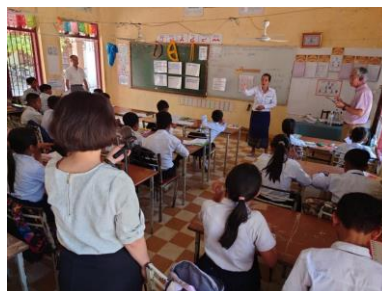
Class observation at primary school by TEC lecturers and professors from Japan

As an extension of this support, JICA launched "the Project for Strengthening Teacher Education Colleges for Basic Education Quality (S-TEC)" in March 2024. The project's vision is to promote "learning with happiness" across Cambodian public schools by enhancing teaching quality at TECs and their attached schools over three years. The S-TEC project focuses on creating a sustainable cycle for enhancing primary and lower secondary education at