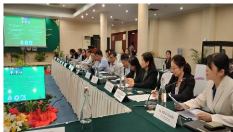
4 th JCC Meeting activity (Strings Project)

July 2024, the project will conduct the second country-focused training on continuing professional development (CPD) in Japan to acquire the necessary knowledge to strengthen the in-service training system for nurses following the first training in 2023.