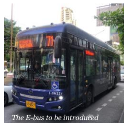
The E-bus to be introduced

the approximately 3,500 vehicles currently owned by the Bangkok Mass Rapid Transit Authority, which operates the public bus service in Bangkok, are older diesel-powered vehicles with poor fuel efficiency and high CO 2 emissions, contributing to the serious air pollution described above. ●