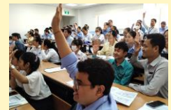
Lectures and teachers at- tended the initial technical Meeting