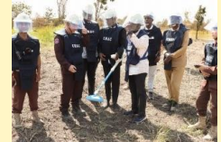
African delegates visiting CMAC's minefield