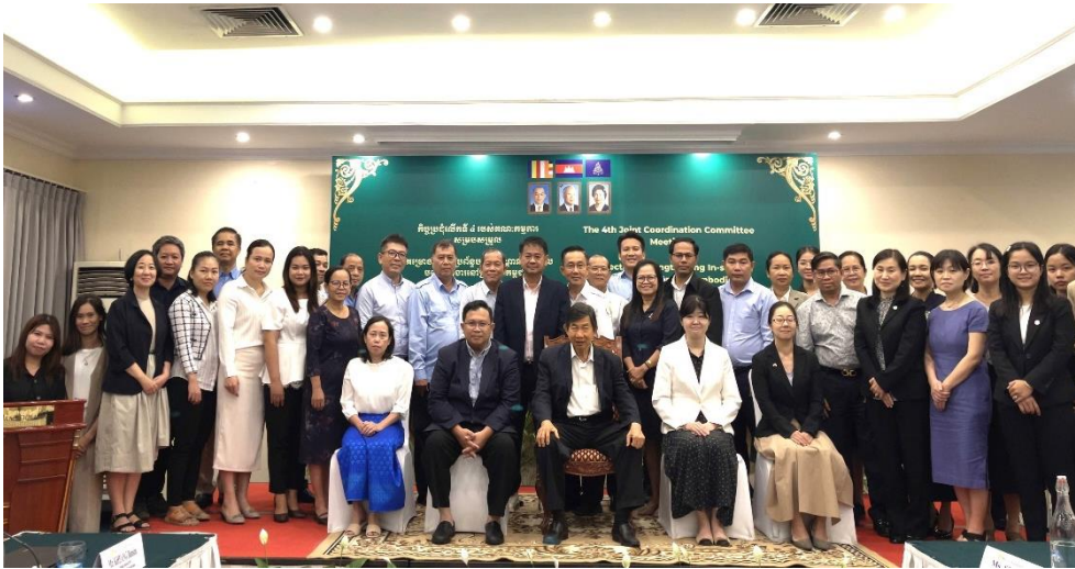
4 th Joint Coordination Committee Meeting (Strings Project)

JICA has supported the health sector in Cambodia, focusing on health system strengthening to achieve Universal Health Coverage (UHC) by 2050. It has addressed these prioritized issues through technical cooperation projects on human resource development, as well as grant aid projects on improving healthcare by rehabilitating health facilities and upgrading medical equipment.