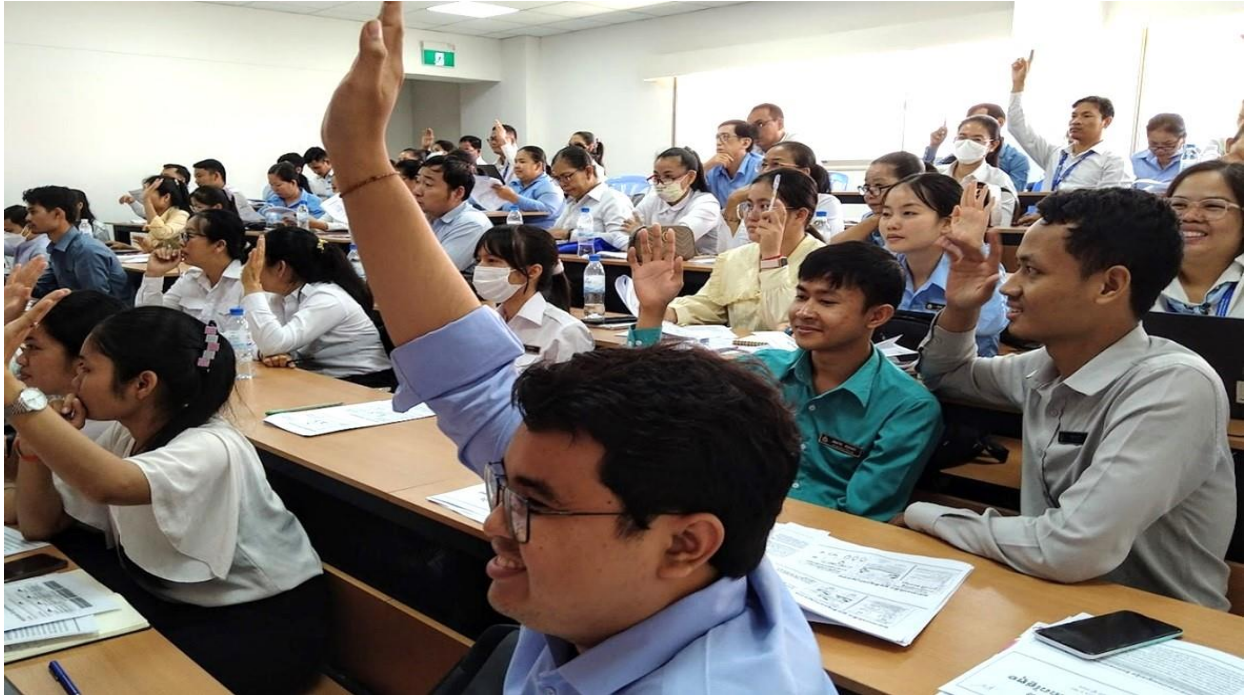
Lecturers and teachers attended the initial technical meeting at PTEC (March 2024)

New project at Teacher Education Colleges "S-TEC" has just launched