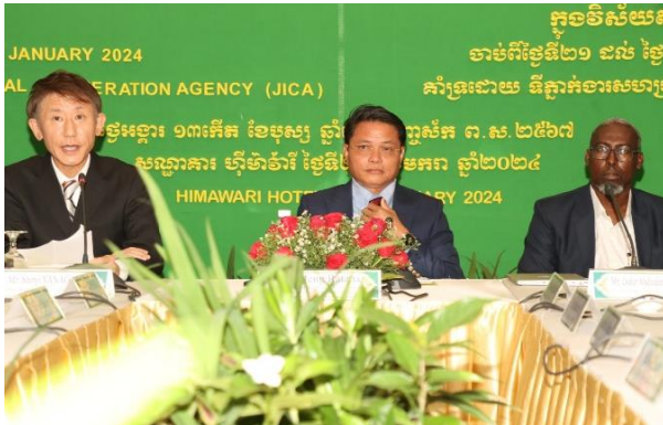
Workshop opening with African delegates

Thirty years ago, no one would have imagined that such a day would come. UNTAC, established in 1991, finished its work in Cambodia in 1992, and the Cambodia government took over responsibility for addressing the landmine problem, which had a serious impact on people's lives.