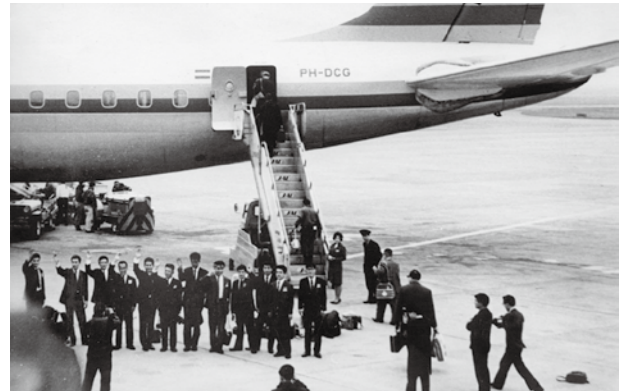
First batch of volunteers departing for their assignments (1965)

Since its first dispatch to Laos in 1965, more than 54,000 JICA volunteers have worked alongside local communities in 98 countries and regions. As summarized by the phrase "together with the local community", JICA volunteers live and work at the grassroots level, speaking the same language as the local communities and carrying out activities with an emphasis on fostering self-reliance for sustainable change.