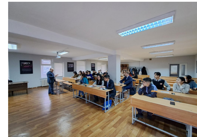
Lecture by a JICA alumnus at the Japan Resource Center at APAPKR