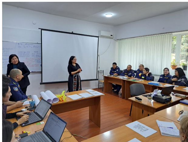
Training for employees of the Osh Oblast Crisis Center within the framework of a mini grant