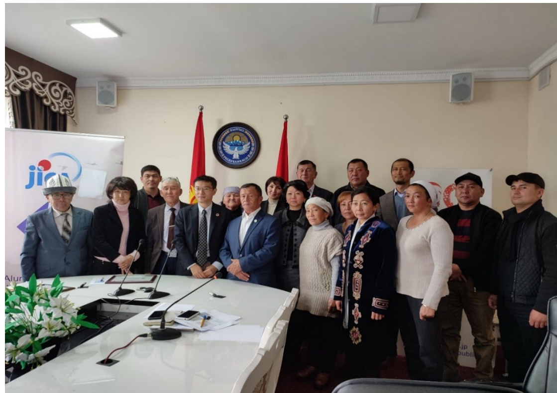
Regional meeting of graduates in Talas 2022