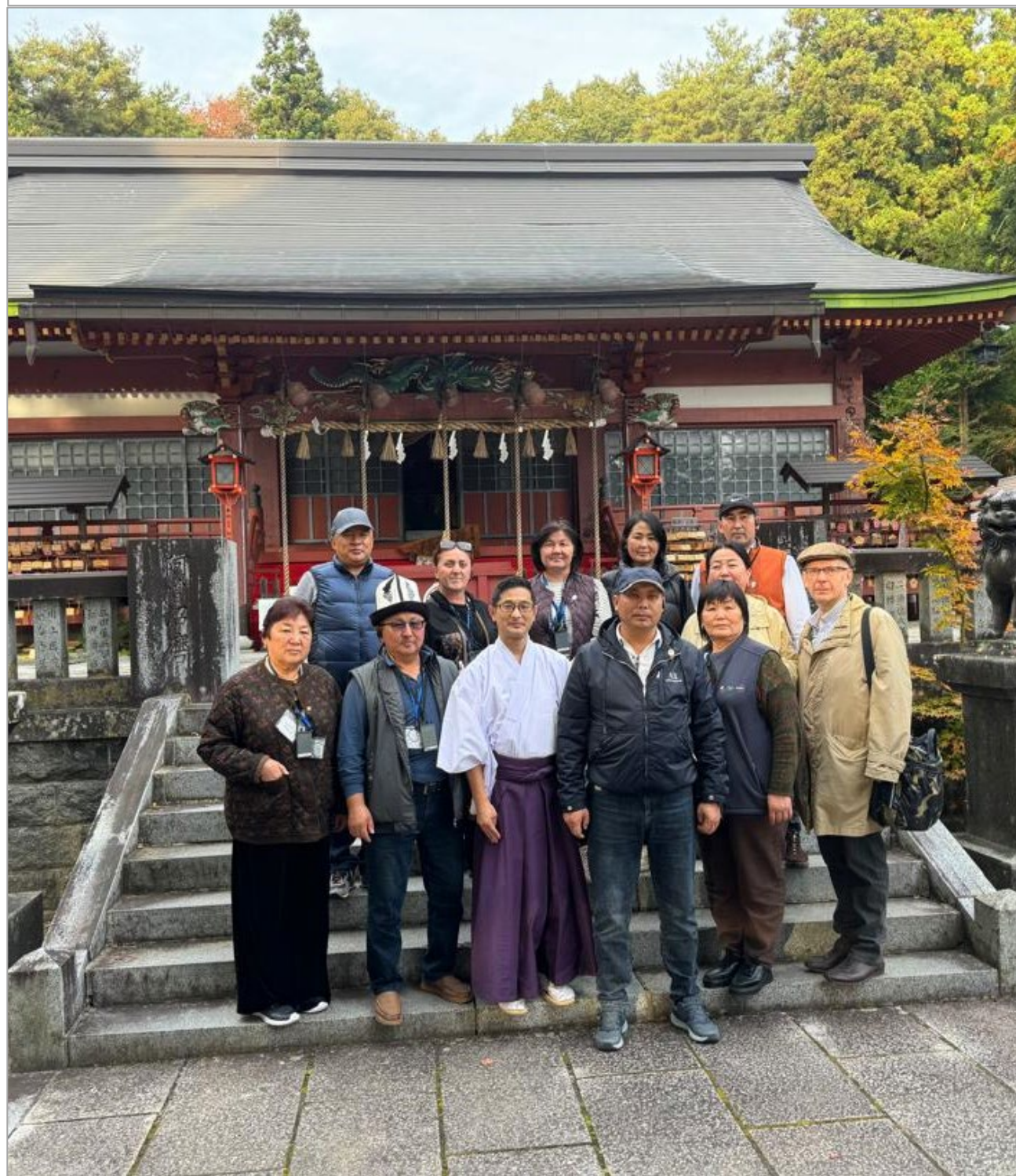
Photo: CFT “ Master Plan Project for Regional development and tourism promotion through the utilization of World Heritage sites in Chui region” (Oct 21-Nov 1, 2024)