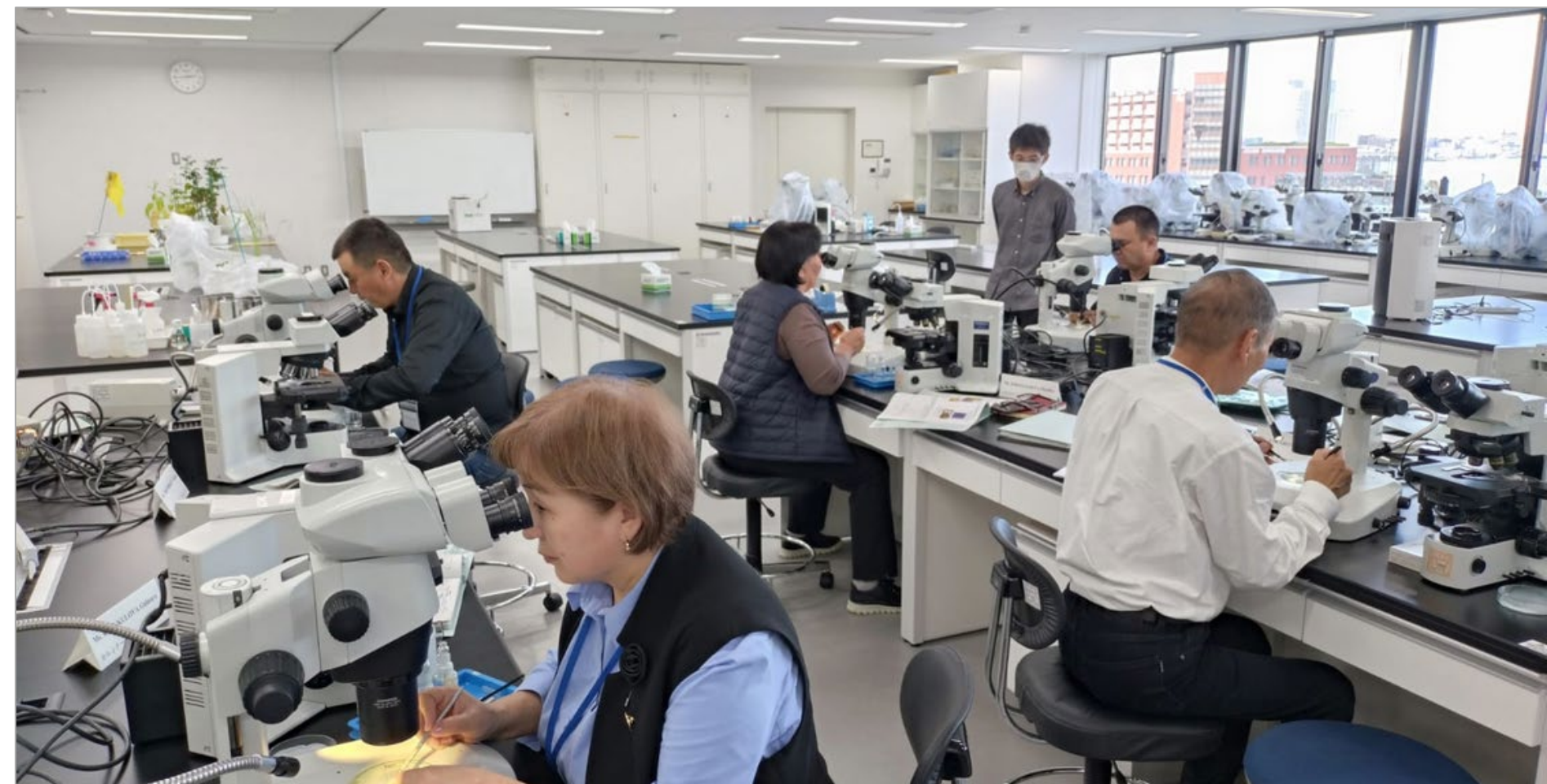
Photo: CFT “Enhancing the capacity of plant quarantine staff aiming at promoting the export of agricultural products” (Oct 24-Nov 7, 2024)

More detailed information about terms of programs, application procedures and necessary documents can be found on the website of the State Agency for Civil Service and Local Self-Government Affairs under the Cabinet of Ministers of the Kyrgyz Republic