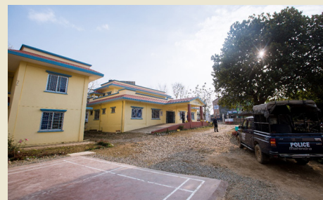
Palungtar Police Station in Gorkha.

were constructed in Gorkha, and the water supply system for Chautara, Sindhupalchowk was rehabilitated.