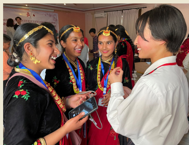
Students from Nepal interacting with the participants from Kamiina Agriculture High School