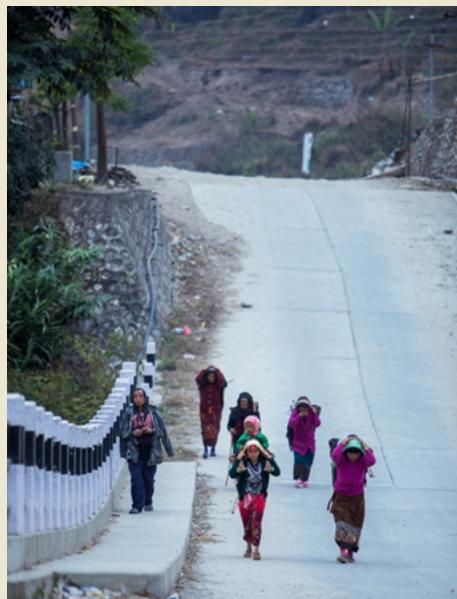
People Walking across bridge in Gorkha

Through JICA's grant assistance, the reconstruction of Bir Hospital and Paropakar Maternity & Women's