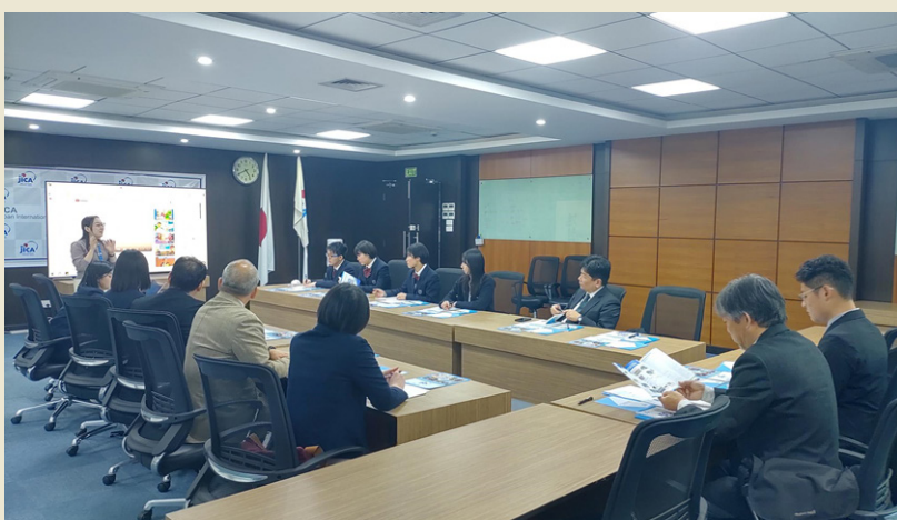
Briefing session for participants in JICA Nepal Office

students from the three target schools of JPP in Mustang, Chitwan and Kavre and exchanged information on their research projects. In Pokhara, they also had an opportunity to observe various Nepalese cultural programs.