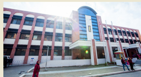
Paropakar Maternity and Women's hospital in Thapathali, Kathmandu

Hospital in Kathmandu was completed in the year 2019. Similarly, Ampipal Hospital in Palungtar and five bridges