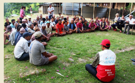
Community meeting, Community Mobilization Program