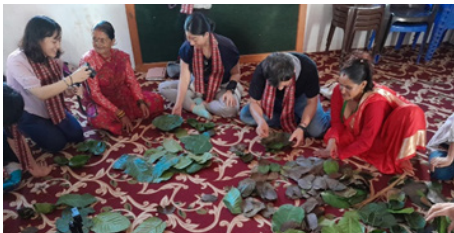
Tapari making in Homestay community