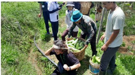
Experience Nepali basket

In addition, the participants must conduct classes and submit their implementation report to JICA Chubu. Sometimes they also have to make some presentation in public event such as global fest.