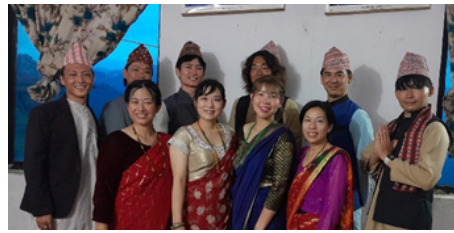
Cultural exchange program