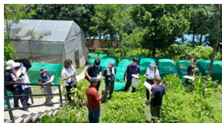
Visit to Love Green Nepal Office