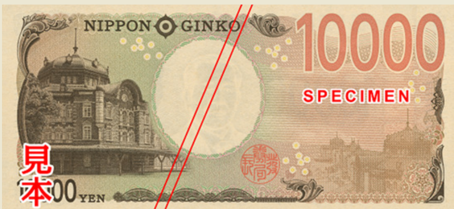
Sample image of the banknote