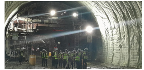
Nagdhunga Tunnel Visit