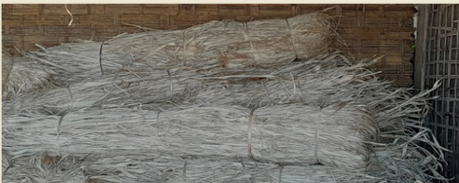
Final material ready for shipping to Japan