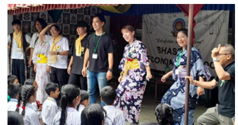
Bhassara School exchange program