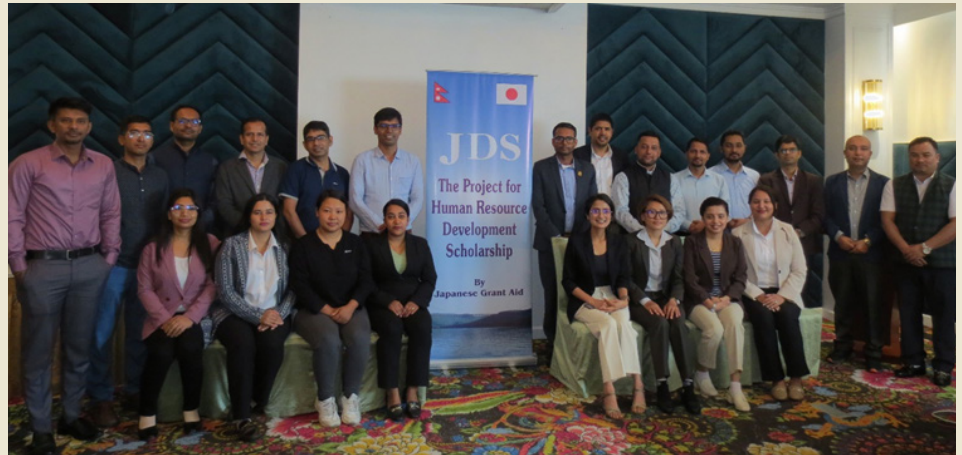
All the 22 JDS fellows

The JDS program aims to bolster the administrative capacities of young and promising civil servants with advanced skills to become future leaders. They are