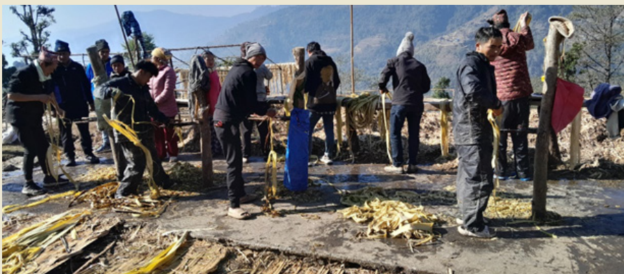
Processing of the plant

The new banknotes not only signify a step forward in sustainable resource utilization but also symbolize the strengthening of ties between Japan and Nepal. As these banknotes enter circulation, they will carry with them a story of international cooperation and the positive impact of sustainable development on local communities.