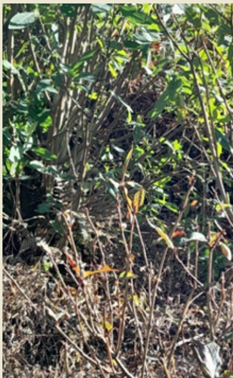
Argeli Plant "Mitsumata"