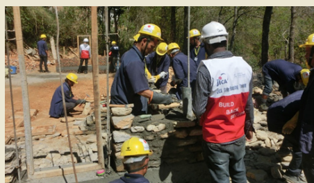
Mason training at Chautara, Sindhupalchowk