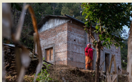
Newly constructed house in Sangachowk, Sindhupalchowk