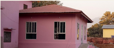
Mediation Centre , Dang

The SCC Project was implemented between 2013 -2018 with the Supreme Court to enhance the capacity of case management and mediation in courts and improve the courts' function for better access to justice. The project's objective was to establish the foundation to improve the court's function for promoting expeditious and reliable dispute settlement. The project aimed at enhancing the Case Management and Court Referred Mediation in Nepal.