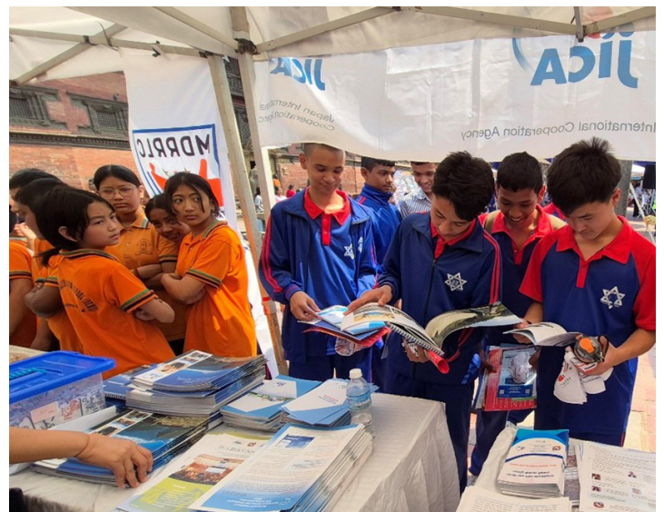
School Children visiting the JICA booth at the Gorkha Earthquake 10th Anniversary Commemoration event organized by Lalitpur Metropolitan City at Patan Durbar Square.