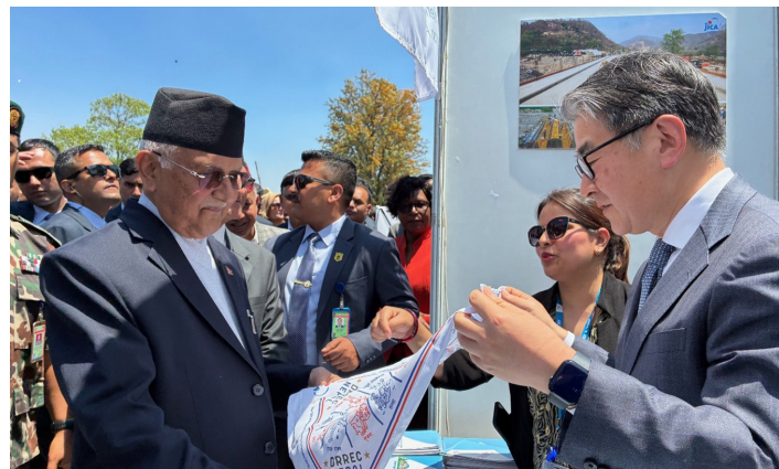
Rt. Honorable Prime Minister of Nepal Mr. Khadga Sharma Prasad Oli's visit to the JICA booth at the Gorkha Earthquake 10th Anniversary Commemoration event organized by the Government of Nepal at the Dharahara in Kathmandu.