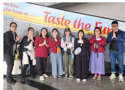
JICA Volunteers upon their arrival at the Tribhuvan International Airport in Nepal.

Over the past 55 years, 1,457 volunteers have contributed to Nepal's development—and the journey continues!