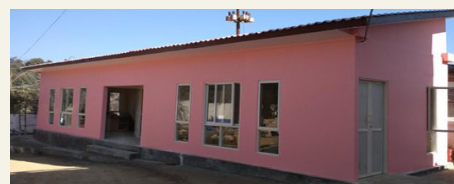
Mediation Centre , Dhulikhel

Case Management Guidelines proved instrumental for strengthening the judicial system in Nepal. The Guideline covers the entire trial procedure in district courts, from registering a case to disposing of it. There are not only laws, but also rules, relevant precedents, and even clues and principles in the Guideline. Each phase of the procedure is explained in detail; so that it helps officials in district courts smoothly process a case, settle timely and ensure access to justice to the public. The Guideline helps to understand the court procedure especially for Judges, court officials and lawyers.