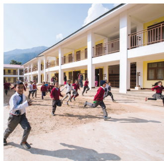
Children playing in their newly reconstructed school in Gorkha.

and water supply facilities under grant assistance of Japanese ODA. In addition to the above-mentioned financial support, the Nepal Earthquake Recovery and econstruction Project has provided technical assistance to rebuild the lives of victims through livelihood training programs such as vegetable cultivation, production of quality seeds, and goat breeding.