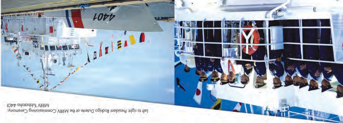
Left to right: President Rodrigo Duterte at the MRV Commissioning Ceremony, MRV Tubataha 4401

Loan Amount: 18,732 million JPY Loan Agreement Signing Date: December 14, 2013 Project Component: - Procurement of 10 MRVs (Multi-role Responsive Vessel) - Consulting Service Contracted Amount: 13,572 million JPY Ship Builder: Japan Marine United Corporation Consultant: JV of Japan Marine Science, Inc. and PADECO Co., Ltd.