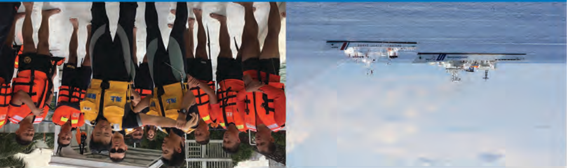
Japan shores experts on maritime law enforcement

"The support from countries like Japan helped strengthen our maritime law enforcement capability and allowed us to recognize the role of everyone in the organization's success." - Coast Guard Staff for Education and Training "In contemporary time, nothing could best describe the importance of the country's maritime domain than that of sending to sea the MRV Class vessels acquired from Japan. She is fast, stable, maneuverable, sleek for inter-island cruise, and a haul sea-worthy vessel even beyond coastal waters." - MRRV4401