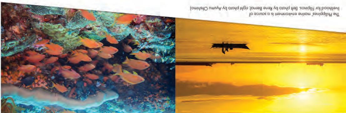
The Philippines' marine environment is a source of livelihood for Filipinos.