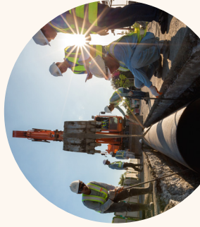
1 Non-Revenue Water Improvement Project in the West Zone of Metro Manila, 2017-ongoing Scheme: Pinar Sector Investment Finance