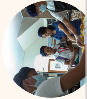
6 To Protect Children's Rights by Children on/of the Streets Scheme: Citizen Participation