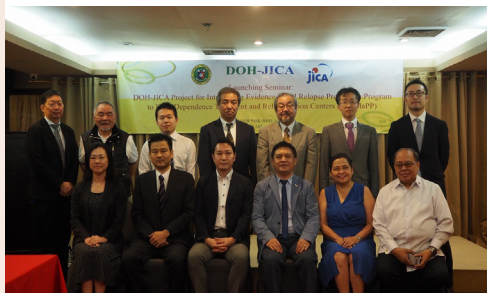
The Project for Introducing Evidence-Based Relapse Prevention Programs to Drug Dependence Treatment and Rehabilitation Centers Scheme: Technical Cooperation / Year of Implementation: 2017-ongoing