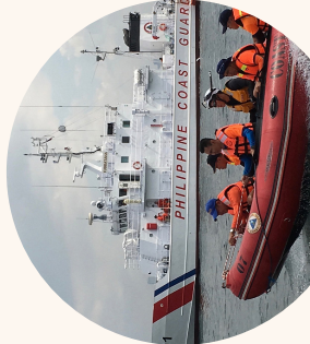
2 PCG Human Resource Development Phase I (2002-2007) Phase II (2008-2013) Scheme: Technical Cooperation Project for Comprehensive Practical Capability Improvement for Maritime Law Enforcement, 2013-2016, 2016-2019 Scheme: Technical Cooperation Maritime Safety Capability Improvement Project Phase I (2013-2022), Phase II (2016-2026)