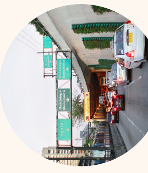
8 Metro Manila Interchange Project Phase IV 1998-2004 Scheme: Yen Loan