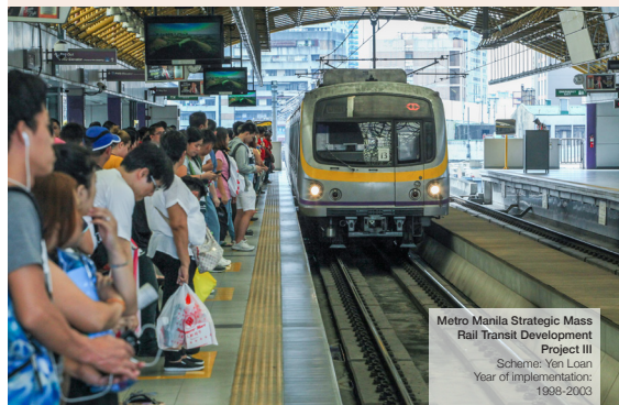
Metro Manila Strategic Mass Rail Transit Development Project III Scheme: Yen Loan Year of Implementation: 1998-2003