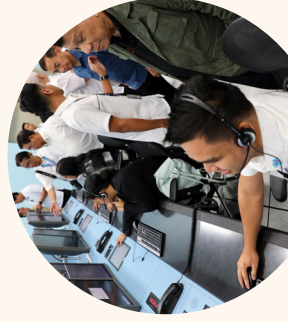
5 New Communications, Navigation and Surveillance / Air Traffic Management Systems Development Project Scheme: Yen Loan