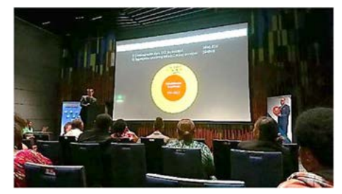
Presentation in the PNG Medical Symposium, 2019

I and my counterparts implemented a clinical study to bridge the gap. Specifically, we reviewed patients' charts of past two years retrospectively and gathered patients' information, such as age, sex, diagnosis, to clarify their characteristics. We revealed that infectious diseases, especially tuberculosis related disease, and orthopedic diseases, e.g. injury and fracture, are very common among physical therapy patients.