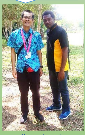
My counterpart (colleague)