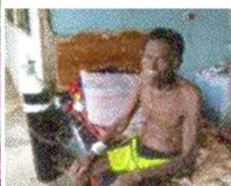
A patients with respiratory problem