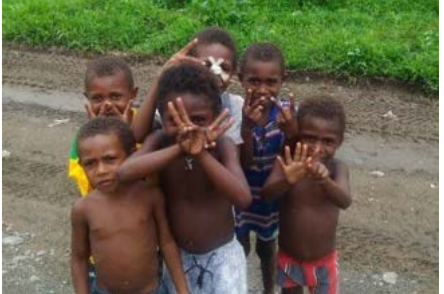
Kids in a rural village