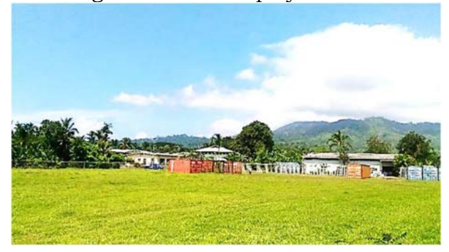
Beautiful sky in PNG