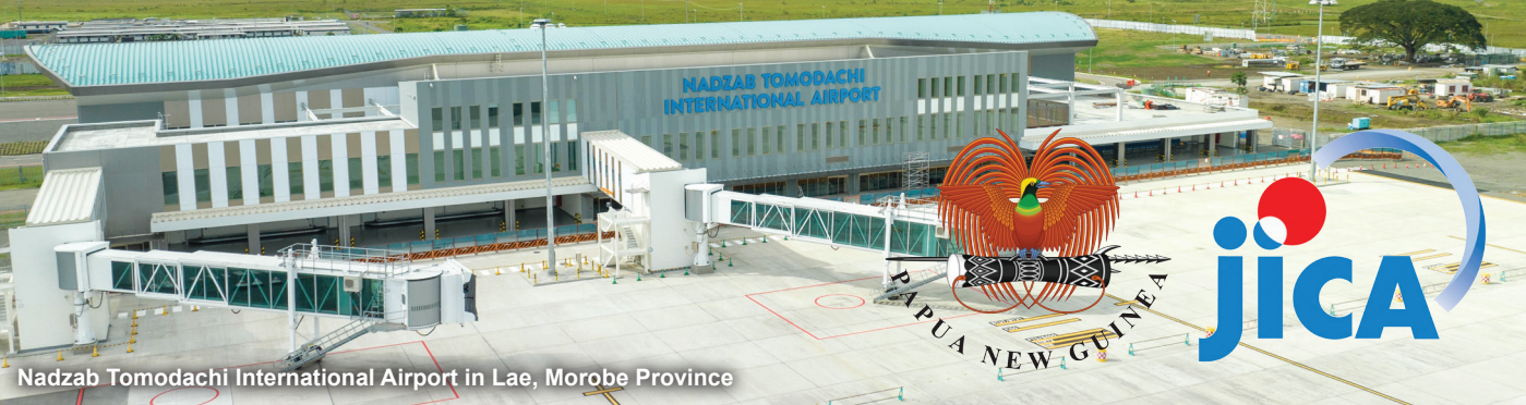
Nadzab Tomodachi International Airport in Lae, Morobe Province