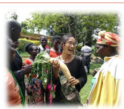
A JICA volunteer interacting with locals on increased harvest

Towards the fight against the COVID-19 and building a resilient country, JICA will