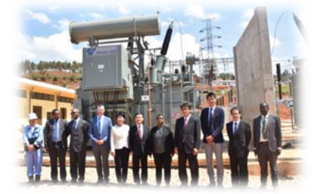
MININFRA and Japanese High officials at the Inauguration of Ndera Substation

The improvement of Substations and Distribution Lines has contributed to strengthening the electricity system in Rwanda, which is crucial especially in health centers during epidemics.