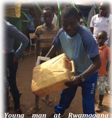
Young man at Rwamagana EXPO, learning how to wash a "jerrycan" from a JOCV

Japanese Overseas Cooperation Volunteers (JOCVs) have been working at the community level in Rwanda since 1987. JOCVs have been active in sensitizing the rural population in keeping hygiene and sanitation. In eastern province, in districts of Rwamagana, Kayonza, Ngoma and Kirehe, the rural population have been sensitized on keeping their hands clean. With the outbreak of COVID-19 in Rwanda these sensitization campaign have helped the population to avoid the spread of COVID 19.