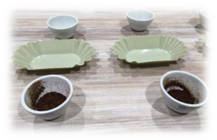
Coffee Cupping in Japan

I have been able to do these activities thanks to my colleagues. I highly appreciate their teamwork and sincerely hope that coronavirus will be over as soon as possible to be able to work together with my colleagues. Murakoze Cyane!