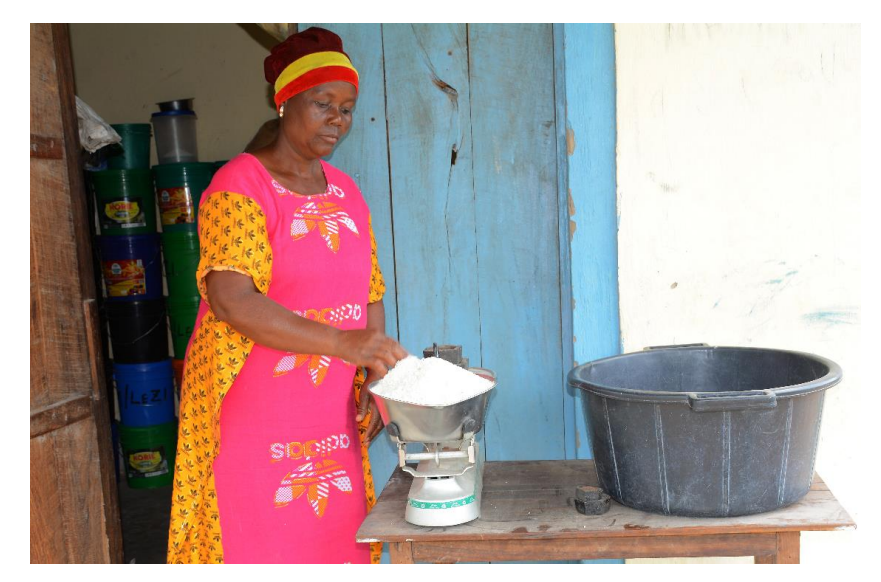
Now all the members get water according to the irrigation water distribution schedule.

There used to be no prior planning of irrigation water sharing. After the operation and management training program, the introduced scheduled water distribution minimized conflicts among the farmers.