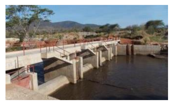
Head works supported by SSIDP

The loan project, Small Scale Irrigation Development Project (SSIDP) rehabilitated or constructed over 100 small irrigation schemes (irrigation capacity with under 500 ha) all over Tanzania 2013 (please see the map on the left). Irrigation engineers and officers together with irrigator's organizations have participated in various training programs to ensure sustainable and practical irrigation scheme development, such as formulation and implementation (F&I) and operation and maintenance (O&M) of irrigation schemes.