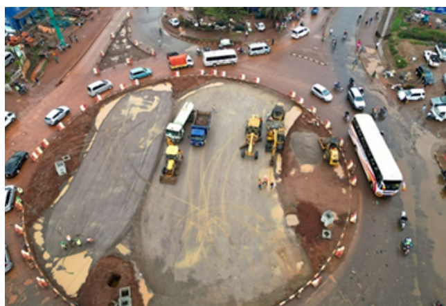
Spear Junction works