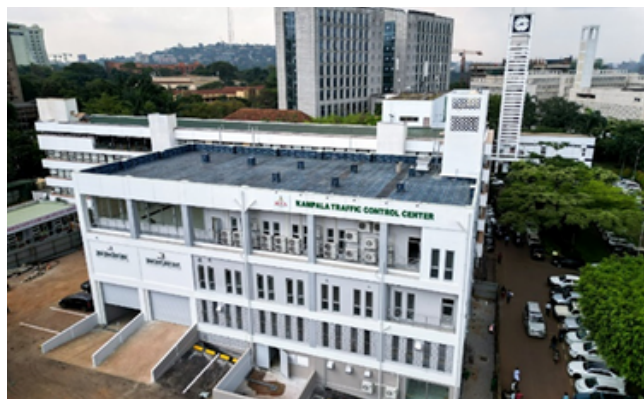
Traffic Control Centre building

According to KCCA, the project progress as at end of July 2024 stood at 69.69% with completion expected in the 2nd quarter of 2025 calendar year.