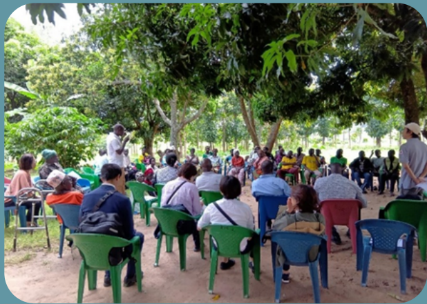
Meeting with the farmer groups in Koboko district (Dranya sub-county)