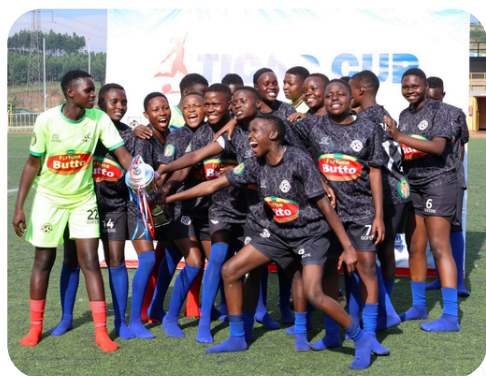
2024 JINJA CITY QUEENS