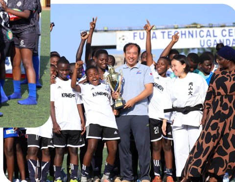
2023 KAWEMPE MUSLIM S.S