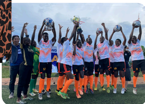
2022 KING OF KINGS S.S

The TICAD CUP 2024 held at FUFA Technical Centre in September was special as it had three refugee and host community teams from Agojo, Pagirinya and Rwamanja refugee settlements. However, Jinja City Queens emerged winners of the tournament and it is