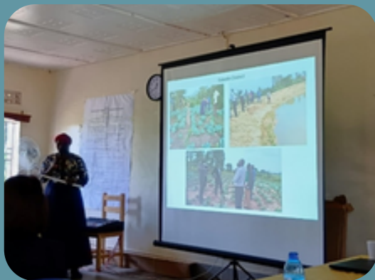
Presentation of activities by Koboko District Community Development Officer.

A Joint Coordination Committee (JCC) Meeting and the Technical Working Group (TWG) for the PROCEED project was held on 7 November 2024, in districts of Maracha and Koboko, to monitor the project progress and make decisions on its implementation.