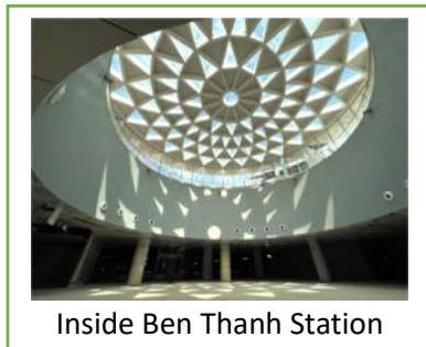
Inside Ben Thanh Station

The trains, manufactured and assembled in Japan, are equipped with advanced safety equipment and signaling systems adhering to Japanese railway standards. Station platforms are installed with automatic platform screen doors to prevent falls onto the tracks, and the facilities are designed to be user-friendly and accessible for people with disabilities (e.g., braille signage, information boards, speaker systems, and priority areas onboard for wheelchairs). Notably, the underground stations were uniquely designed to harmonize with the surrounding urban landscapes. Construction was carried out through a collaborative effort between Japanese contractors, known for their advanced technical and managerial expertise, and Vietnamese companies.