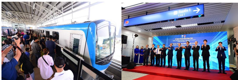
Caption: Suoi Tien Terminal platform (left); Protocol for starting commercial operations (right)