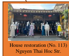
House restoration (No. 113) Nguyen Thai Hoc Str.