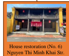
House restoration (No. 6) Nguyen Thi Minh Khai Str.

It's been over 400 years after the construction of Japanese Bridge, a symbol of Japan-Vietnam relationship. Conditions of its structure have been deteriorated despite the multiple restorations so far. Japan, with more than 20-years history of cooperation with Hoi An City, has decided to dispatch experts for advising the City on the restoration method and construction planning and supervision, and for transferring the knowledge of the Japanese technology.