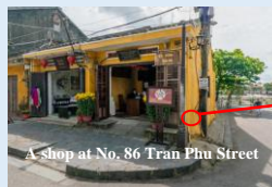
A shop at No. 86 Tran Phu Street