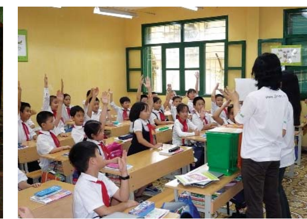
3R Initiative in Hanoi