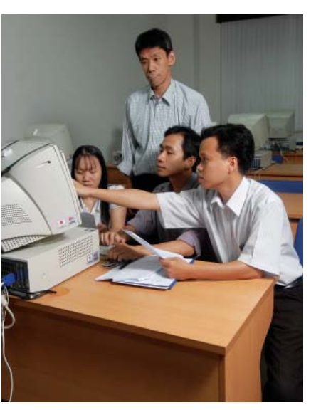
Business course (VJCC)

Along the National Highway No. 5 and No. 18 constructed by Japan's ODA loan, many industrial zones have appeared and private investment is developing more and more. In 2000, the "North Thang Long Industrial Park" was completed under the investment of Japanese enterprises. Japan's ODA has been used for constructing transport infrastructure, a water supply system, a waste water treatment system, and electricity generating stations, and it became the model for the Public Private Partnership (PPP) program. Here in the industrial park, a lot of Japanese enterprises are operating, creating jobs for around 50,000 people and making great contribution to the economic development of Hanoi.