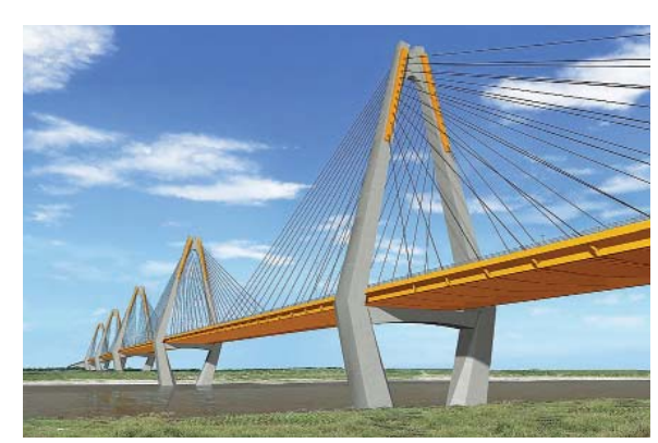
Nhat Tan Bridge (Vietnam - Japan Friendship Bridge)

Modernization of transport infrastructure