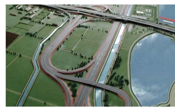
Interchanges of Ring Road No. 3

Japan's ODA loan has also been allocated to upgrading inland transport system of Hanoi as well as national roads connecting Hanoi with surrounding satellite cities. Following the expansion and upgrade of National Highway No. 5 (Hanoi-Hai Phong) and National Highway No. 18 (Hanoi-Quang Ninh), Japan agreed to provide assistance to the construction of National Highway No. 3 (Hanoi-Thai Nguyen). After the completion of the Thanh Tri Bridge construction (also called Hong Ha Bridge) in 2007, Japan helped to construct the Ring Road No. 3 in Hanoi connecting the bridge to Thang