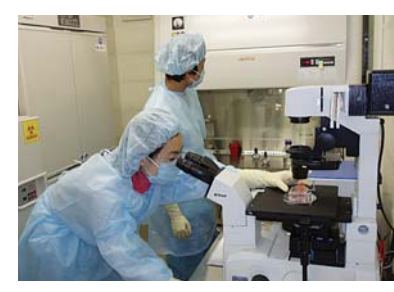
Bach Mai Hospital