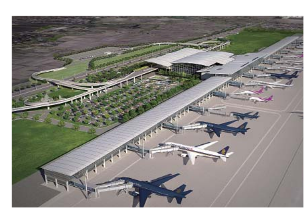
Terminal 2 in Noi Bai International Airport

In 2010, the 1000th Anniversary of Thang Long-Hanoi, the first Japan's ODA project signed was the Terminal 2 Construction project at Noi Bai International Airport. A new highway connecting the airport with Hanoi will also be built using Japan's ODA loan. Since 2009, the Nhat Tan Bridge (also called Vietnam-Japan Friendship Bridge) crossing the Red River, a part of the highway, has been under construction by Japan's ODA. In 2014, these programs, particularly the new port of Noi Bai Airport, will be the new international gateway to Hanoi.