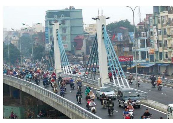
Nga Tu So Flyover

For the past ten years, in order to improve the transport situation of Hanoi, Japan has assisted in upgrading and expanding key parts of the road network as well as constructing interchanges such as Nga Tu So flyover, Kim Lien underpass intersections and pedestrian bridges. Moreover, Japan has cooperated in constructing urban railway and an underground system for Hanoi (line 1 connecting Yen Vien - Hanoi -Ngoc Hoi and line 2 connecting Tran Hung Dao - Nam Long Bien - Nam Thang Long). The urban railway is expected to contribute to the basic improvement of the transport system, reduction of traffic jams and improvement of Hanoi's environment.