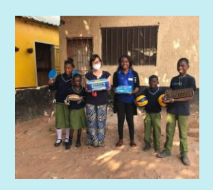
Cornerstone of Hope received Sports items from the "Smile for All in the World" Team courtesy of JICA Volunteer Program