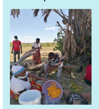
Mango Jam processing at Tiwine Coorperative