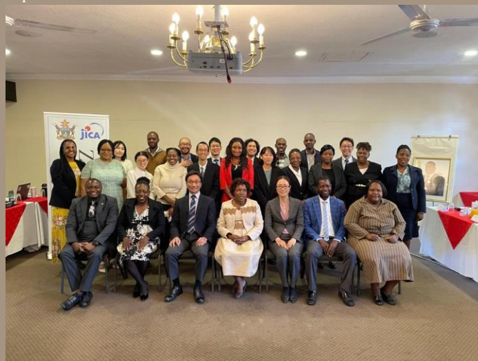
Participants at the JCC meeting

After the monitoring and evaluation by the Joint Terminal Evaluation Mission, a Joint Coordinating Committee (JCC) meeting was held on 5 September 2024.