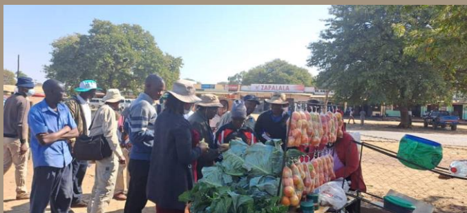
Farmers conducting market survey in open market

The Project for Zimbabwe Smallholder Horticulture Empowerment and Promotion (ZIM-SHEP) Team conducted Market surveys in 6 targeted irrigation schemes in Matabeleland North (Hauke, Tshongokwe, Chentali) and Matabeleland South (Moza, Antelope, Masholomoshe) provinces in July and August 2024 respectively. The exercise was an eye-opener for farmers who were unaware of the availability of local and more profitable markets such as boarding schools, supermarkets, and traditional open markets.