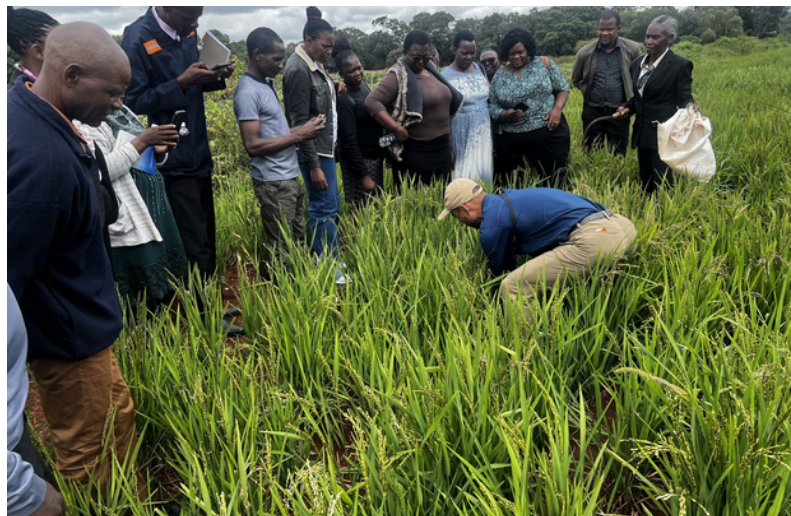
Rice harvest and post harvest training

Looking ahead, the training is a critical step towards improving rice quality, reducing post-harvest losses, and enhancing farmer incomes. By strengthening the skills of frontline Extension Officers, JICA and DR'ESS continue to support sustainable rice production and value addition across irrigation schemes.