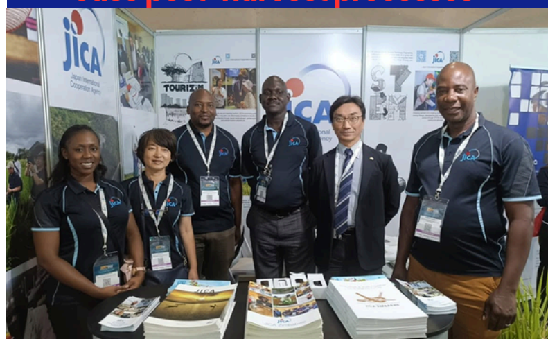
JICA team at the 2026 ZITF

https://www.jica.go.jp/oda/project/201902918/en_news/newsletter.html