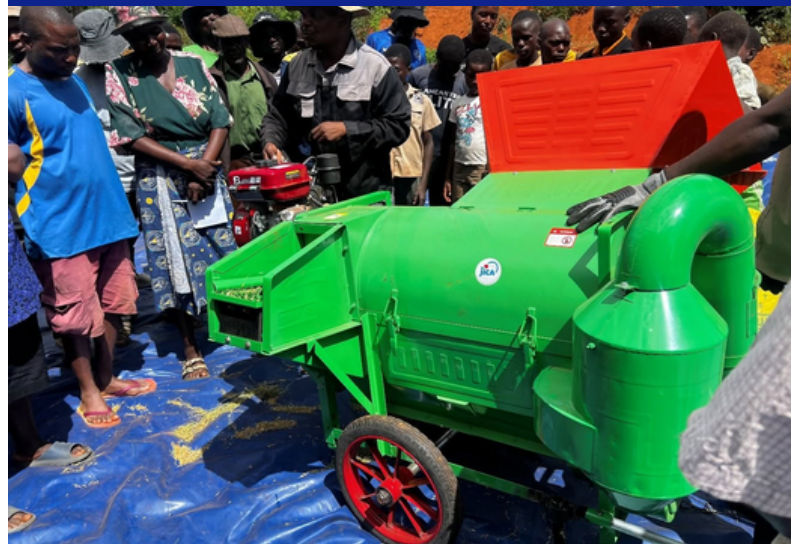
JICA provided rice threshers to ease post-harvest processes