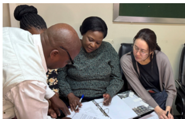
5S-KAIZEN-TQM Project makes definitive milestones

As the project heads out to a conclusion in May 2026, read on the project's activities in improving health services, best practices, and solutions for common challenges related to stock management, patient flow management, safety, and waste management: