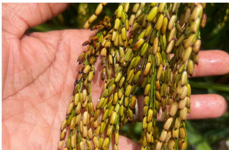
NERICA Rice: A Growing Success Story

https://www.jica.go.jp/oda/project/201902918/en_news/newsletter.html