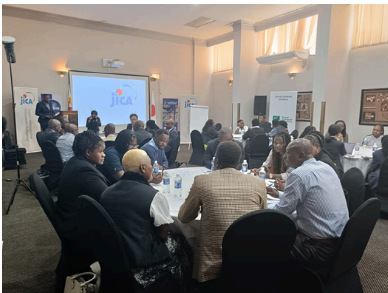
The Zimbabwe Startup Ecosystem Harmonization Sprint

The sprint successfully met its core objective of charting a clear way forward to help student-led ventures transition from academic laboratories to the global marketplace.