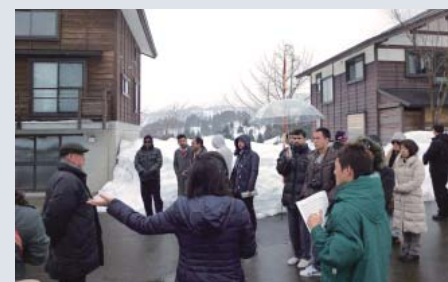
Program participants visit homes in Ojiya, Niigata, which were rebuilt as part of earthquake recovery efforts.

ing program, launching it in 2007. In 2012, 14 government officials and researchers from eight countries, including China, the Philippines, Mexico, and Turkey, stayed overnight in the city for training and interacted with local residents. These exchanges generate the energy to go forward with recovery efforts.