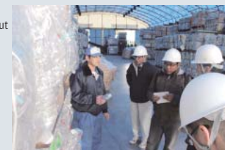
City officials from Banda Aceh learn about waste disposal in Higashi Matsushima.