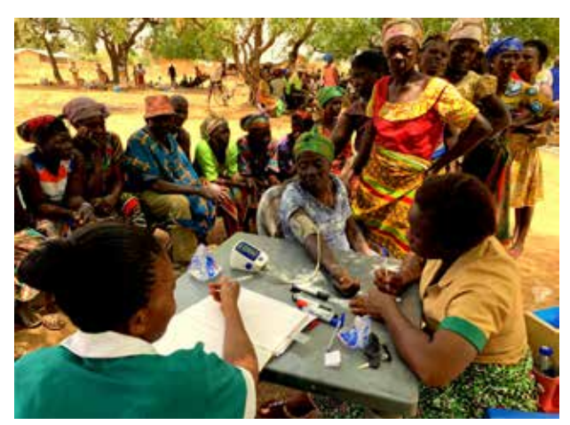
Measuring adults' blood pressure in a village square. Ghana does not yet have health checkups for adults.

With the support of JICA experts, CHPS has been implemented faster in the Upper West Region than in other regions. Since 2017, the region has seen the implementation of health services based on a person's life span*, which not only addresses maternal and child health, but also aims to prevent disease and promote