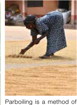
Parboiling is a method of processing rice in which rough rice is soaked in hot or cold water, steamed, dried (shown in photo), and then milled

handbooks with JICA's support in 2016, and the completed handbooks have been distributed nationwide since 2018. JICA is cooperating with the Ministry of Health to train health workers from all over the country for the effective use of the handbooks. By November 2019, over 1,500 health workers had received training and completed the training course.