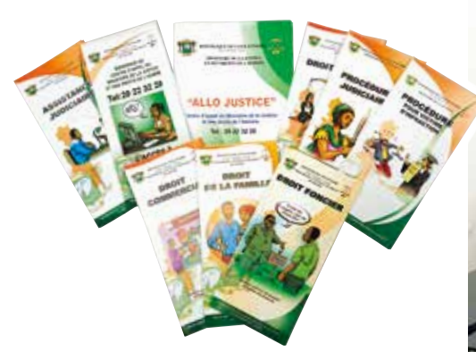
Brochures were prepared when the call center was opened to provide legal and judicial information.