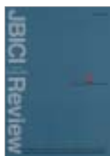
■ Research Reports of JBIC Institute