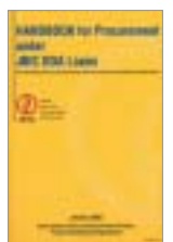
■ Handbook for Procurement under JBIC ODA Loans (The Employment of Consultants & Procurement of Goods and Services)