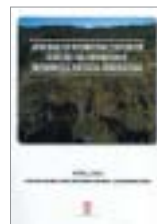
■ JBIC Guidelines for Confirmation of Environmental and Social Considerations