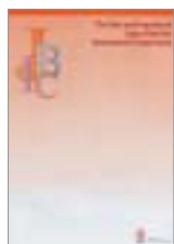
■ The Role and Function of JBIC