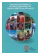
■ Operational Guidance on the Preparation for Japan's ODA Loan Projects