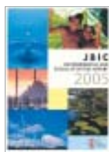
■ Environmental and Social Activities Report