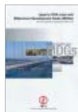
■ Japan's ODA Loan and Millennium Development Goals (MDGs)