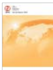
■ Annual Report