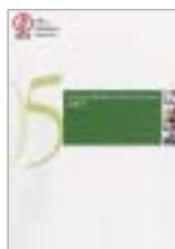
■ Ex-Post Evaluation Report on ODA Loan Projects