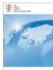
■ ODA Loan Report