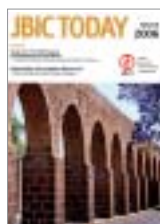
■ JBIC Today (public information periodical)

JBIC is disclosing information on its operations, financial results and other relevant matters.