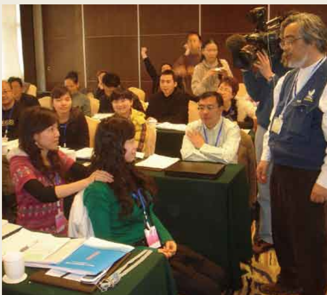
Seminar participants practice relaxation methods to be used for schoolchildren.

these areas are still suffering from psychological trauma, which in some cases is disrupting people's daily lives. Some children who experienced the earthquake have nightmares or have difficulties in concentrating during school lectures. These situations have uncovered such major issues as the shortage of human resources specifically trained to provide care for these children and the unavailability of such care services over the long term. Japan has a track record in this area, having provided long-term mental healthcare services to the victims of the 1995 Great Hanshin-Awaji Earthquake. Deriving the maximum benefit from such experience, JICA began the five-year Project for Capacity Development on Mental Health Services for Reconstruction Support of Sichuan Earthquake in June 2009. Through this project, JICA will continue to support teachers, medical personnel, social workers and other people who are involved with mental healthcare services.