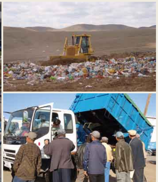
Top: A local staff member practices sanitary landfill using heavy machinery provided by JICA.