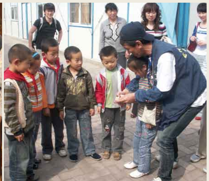
A Japanese elementary school teacher from Hyogo Prefecture communicates with children living in temporary housing.