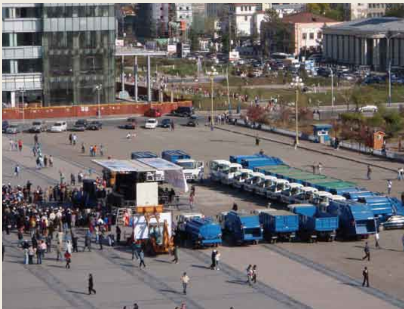
Some of the vehicles supplied to facilitate appropriate waste collection