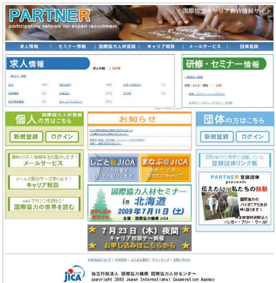
Top page of the PARTNER website (Japanese only)