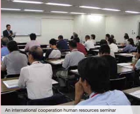
An international cooperation human resources seminar

Implementation System: Cooperation Modality