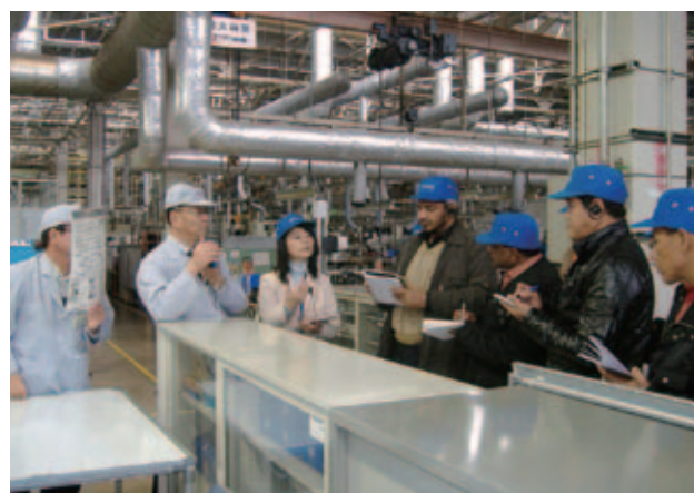
JICA Chubu implements numerous training programs for Asia and Africa, Central and South America and the Middle East, including the Group Training "Japanese MONOZUKURI and Manufacturing in Developing Countries" course.

As expressed in the phrase " wakon-yosai " ("Japanese spirit, Western skill"), Japan has experience in skillfully absorbing and adapting new knowledge and outstanding technology obtained from abroad for developing the country in harmony with the domestic situation. There is much that developing countries too will find beneficial from this experience in the process of nation building in response to globalization. Drawing on these elements