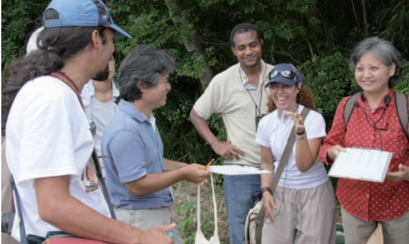
At JICA Okinawa, training is implemented on the theme of tourism development for the Central America and Caribbean region and Oceania where the climate is similar to Okinawa's, as well as the tropical and sub-tropical regions (Group Training "Planning and Management of Eco-tourism in Tropical and Subtropical Area").

respective countries from a different perspective.