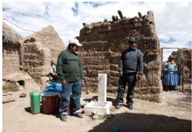
Pipes link the water storage tank with houses in the community (Bolivia: “Water is Health and Life” Project)