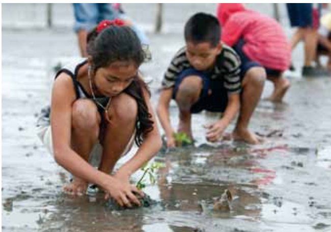
Children plant mangrove seedlings (Philippines: Improvement of QOL through Means of Reforestation of Mangroves in Negros Island Project)

JICA continues to enhance development effectiveness by facilitating South-South and triangular cooperation, and exploring close partnerships with NGOs and the private sector.