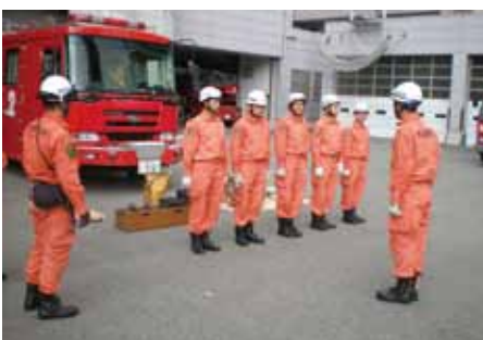
JICA Tokyo: A training course on firefighting techniques by sharing Japan's firefighting and rescue activity skills that could be applied to developing countries. (Region Focused Training and Dialogue: Training on Firefighting Command Techniques - Vietnam)

Implementation of training programs in Japan has significance with regard to utilizing Japan's development experience and know-how, rather than sharing Japan's advanced technologies and skills. To learn and understand Japan's "knowledge", it is often necessary to use on-site experience upon Japan's organizational know-how, and the backgrounds and transitions underlying its social system. Moreover, a particular characteristic of JICA's Training and Dialogue Programs is to provide an opportunity for participants to become aware of and to reexamine the experience and the actual circumstance of their own countries from outside by experiencing Japan. Hence,