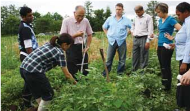
JICA Hokkaido (Obihiro): A training course on environment-oriented agriculture by utilizing Obihiro's characteristic as an agricultural production base (International Training and Dialogue: Environment-oriented Agriculture for Increase of Food Production)

acquired in Japan, and to promote greater understanding of Japan in developing countries.