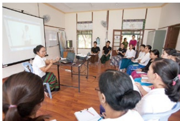
Project for Supporting Social Welfare Administration -Promotion of the Social Participation of the Deaf Community Phase 2 (Myanmar): A skill improvement course is being provided for sign language trainers.