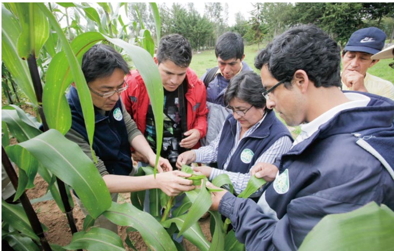
Project for Improving Livelihood of Small-scale Farmers in Cajamarca (Peru): An expert is checking for diseases of purple corn and giving advice to the local counterparts, in order to improve the livelihood of the small-scale farmers.