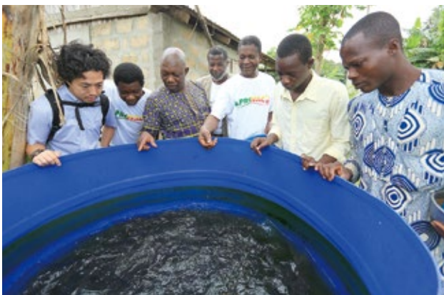
Project for the Extension of Inland Aquaculture (Benin): An expert is checking catfish and tilapia at a farm house, for the purpose of promoting inland aquaculture

JICA invites competent personnel in developing countries, who are responsible for social and economic development, to Japan as training participants. They participate in training programs in Japan to acquire the knowledge and technologies needed in their countries (e.g. Group and Region-focused Training Programs, Training Programs for Young Leaders). JICA also organizes