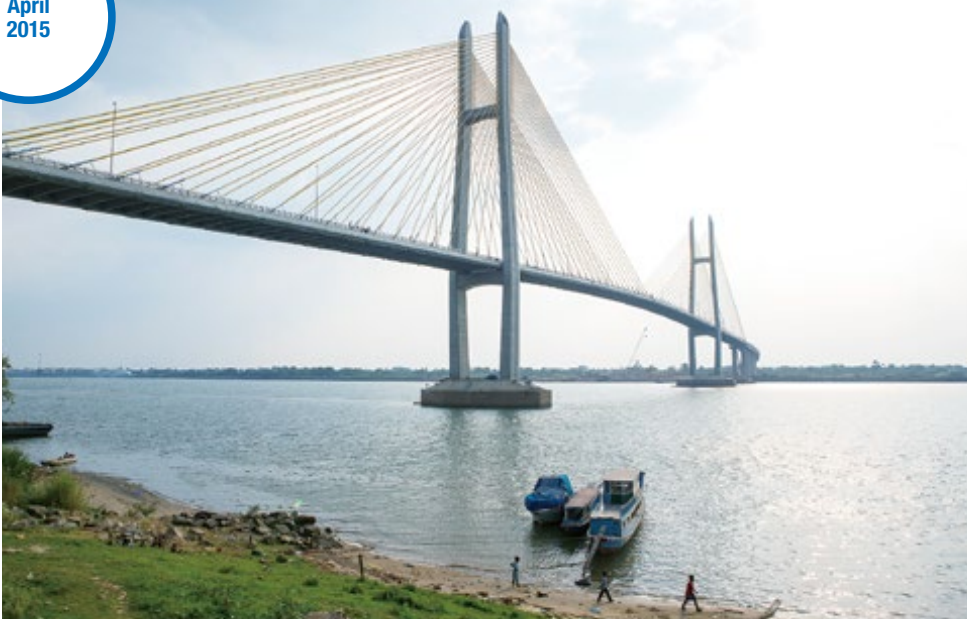
The bridge was named "Tsubasa Bridge" as it has the appearance of two birds spreading their wings ( tsubasa in Japanese). The name symbolizes Cambodia's aspirations for further friendly relations with Japan.

The Southern Economic Corridor now connects Viet Nam with Bangkok via Cambodia. With Japanese Grants, Tsubasa Bridge has been constructed across the Mekong River, the remaining major bottleneck along the corridor. The large-scale construction, covering a total length of over 5 km, was completed within schedule owing much to Japan's advanced technology, despite the detonation of unexploded ordnance and heavy floods. To help enhance ASEAN connectivity, JICA also provided ODA Loans to support National Road No. 5, which connects Phnom Penh and the Cambodia-Thailand border.