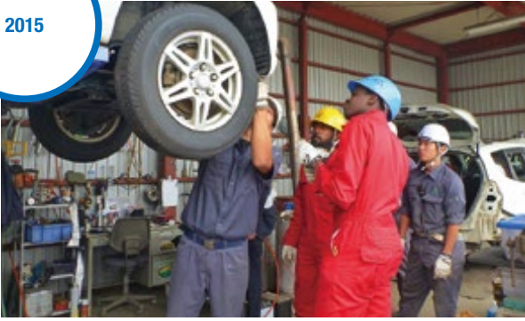
African students learn as interns at a Japanese firm.