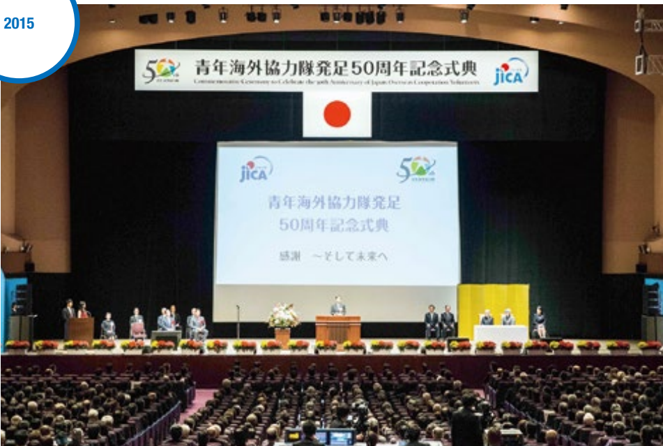
The ceremony marking the 50th anniversary of the JOCV Program was attended by some 4,500 people.