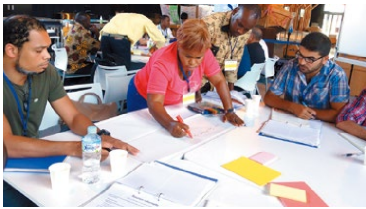
Participants work on Japanese fishing lifestyles and challenges at Himi Fishery Network Gallery Totoza in Himi City, Toyama Prefecture, in the Fishery Using Resource Management Approach Course under KCCP (Young Leaders) for French-speaking countries in Africa.

viewpoints among all participating countries by exchanging opinions and information. Group and Region Focus courses thus offer valuable insights and discoveries to each participant.