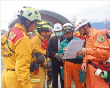
The Japanese expert team teaches a Taiwanese rescue team how to use the equipment.

On February 7, 2018, a major earthquake hit eastern Taiwan. In response, the Japanese government dispatched a JDR expert team of eight. Upon arrival at Hualien County, the team immediately started supporting search and rescue operations by Taiwanese rescue teams.