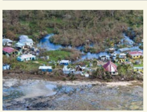
A village hit by Cyclone Harold

Situated at the center of the South Pacific, Fiji is prone to cyclones from November to April. Almost every year, cyclones destroy buildings and inundate homes and farmland in the country. In February 2016, Cyclone Winston, one of the most intense cyclones on record, made landfall in Fiji, causing damage totaling some $600 million (equivalent to about one-third of the national annual budget).