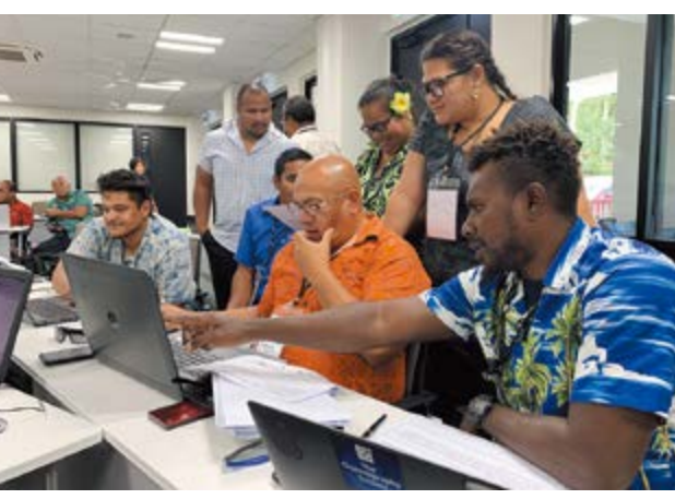
Samoa: Training participants engaging in group work at PCCC under the Project for Capacity Building on Climate Resilience in the Pacific

PICs commit to increase renewable energy supply, and JICA