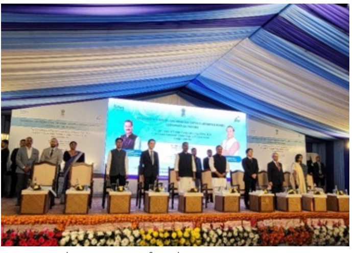
Inaugural Ceremony for the Partial Commissioning

*Calculated at the prevailing exchange ratio at the time of this announcement: 1 INR = 1.69649 JPY