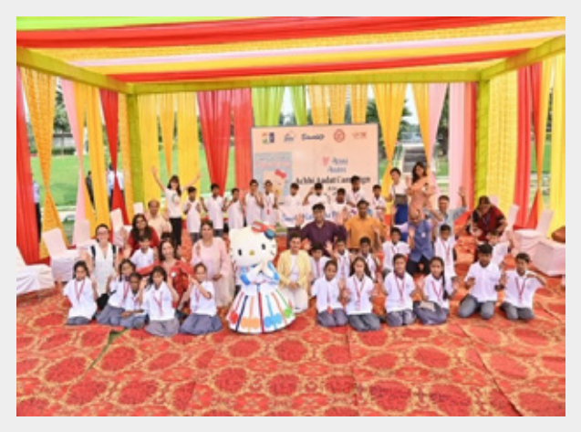
Group photo with students of St. James Convent School