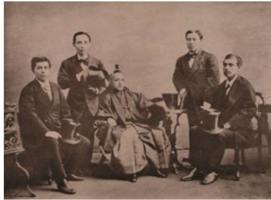
Members of Iwakura Mission (1872)

JICA will also provide reference materials for Japanese studies and research and education opportunities to faculty members of universities who wish to establish or strengthen courses or programs of Japanese studies.