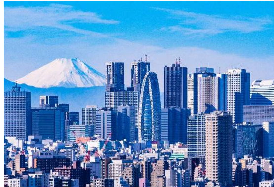
Skyscrapers in Tokyo and Mt. Fuji (2020)

Office for JICA Development Studies Program