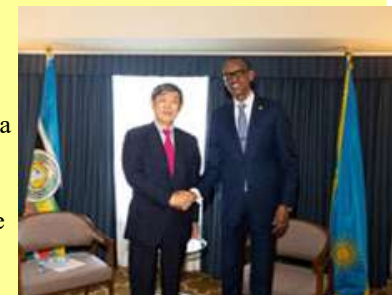
JICA President Kitaoka and Rwanda President Kagame

lectures on Japan and Asia's development experiences in collaboration with a Japanese university and a research institute. JICA will also provide DVDs. Related materials will be donated by courtesy of the Nippon Foundation.