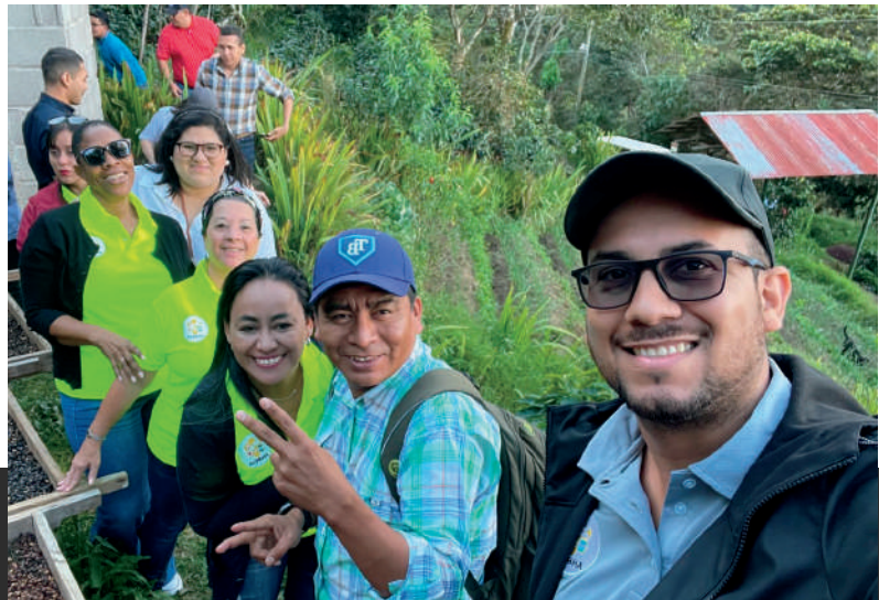
Coffee processing plant - San Juancito