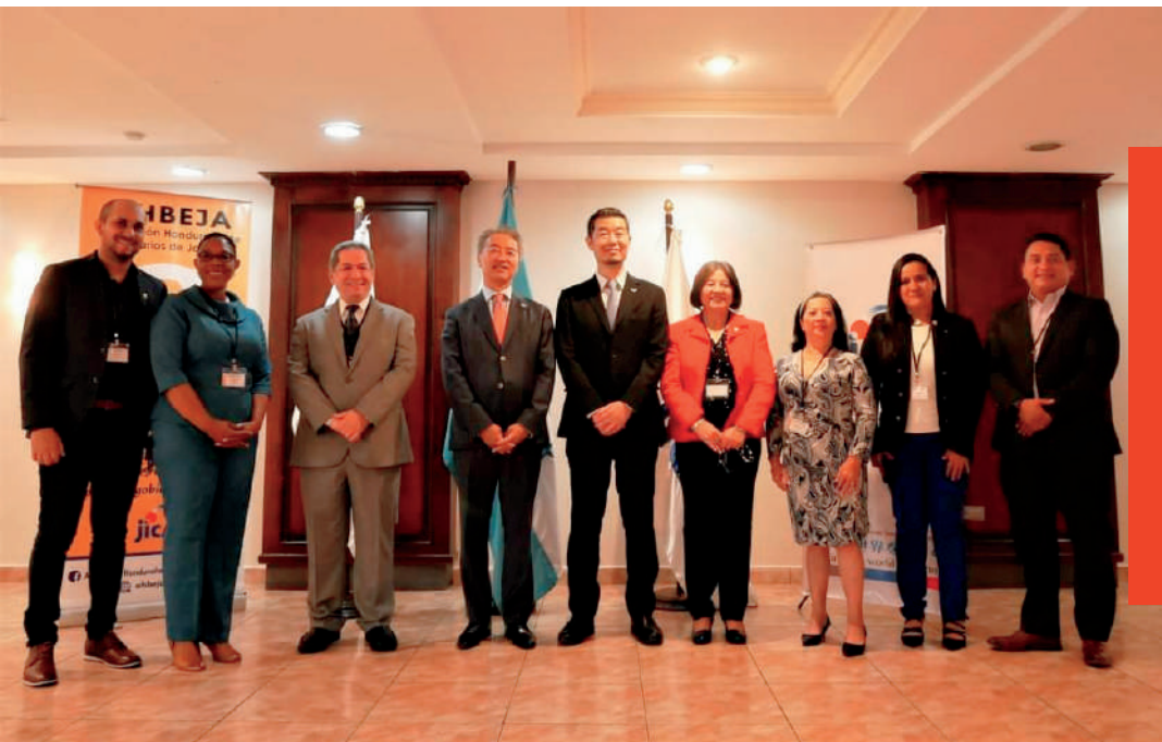
L-R: Presidents of Panama, Jamaica, El Salvador, Japanese Ambassador, Resident Representative of JICA Honduras and Presidents of Honduras, Costa Rica, Nicaragua and Guatemala