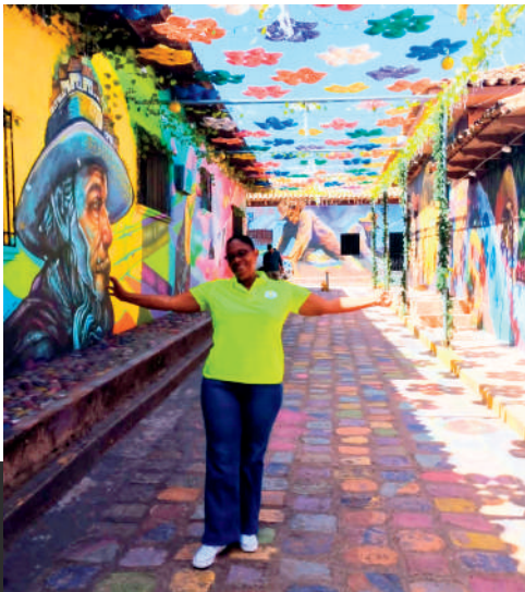
Selfie Village - Cantarranas

The Alumni Associations of each country have been using their platforms to transfer knowledge gained in Japan to contribute to the development of communities and the promotion of activities aimed at strengthening the friendship and understanding between Japan and the individual countries.