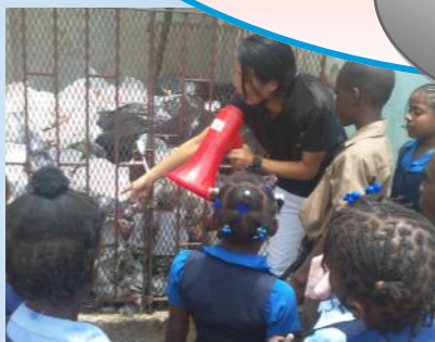
JOCV Member conducting Environmental Awareness session at a primary school.