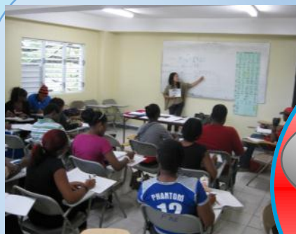
JOCV member dispatched to The University of West Indies instructing a Japanese Language class.

Together with counterparts in the local organization to which they are dispatched, volunteers help to build the capacity of the host organization and support project and programs. They plan, collaborate and evaluate with the counterpart and other local staff. The purpose of the JOCV is for the volunteer and the local staff to learn and work together.