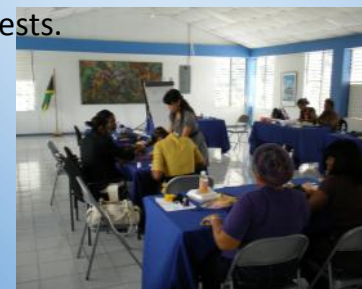
JAID staff / teachers at a handicraft workshop organized by volunteers dispatched to Jamaica 4H club and JAID schools

In addition to the regular volunteer dispatch period of two (2) years (long-term volunteers), short-term volunteers can be recruited and dispatched for periods of less than one year in response to local requests.