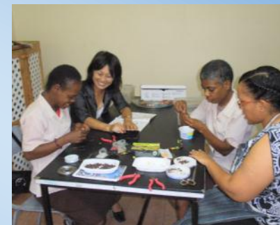
SV working with crafters at Chupse studio (JAID)