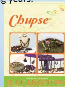
JAID Adult Centre Program- Chupse Studio Flyer