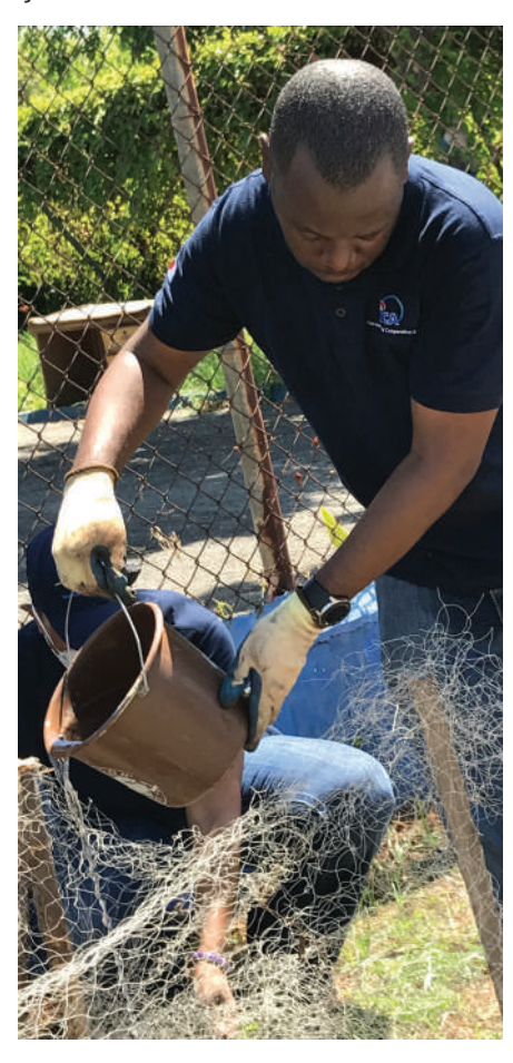
Tree planting at the Paradise Basic School with student, principal, parent and community members