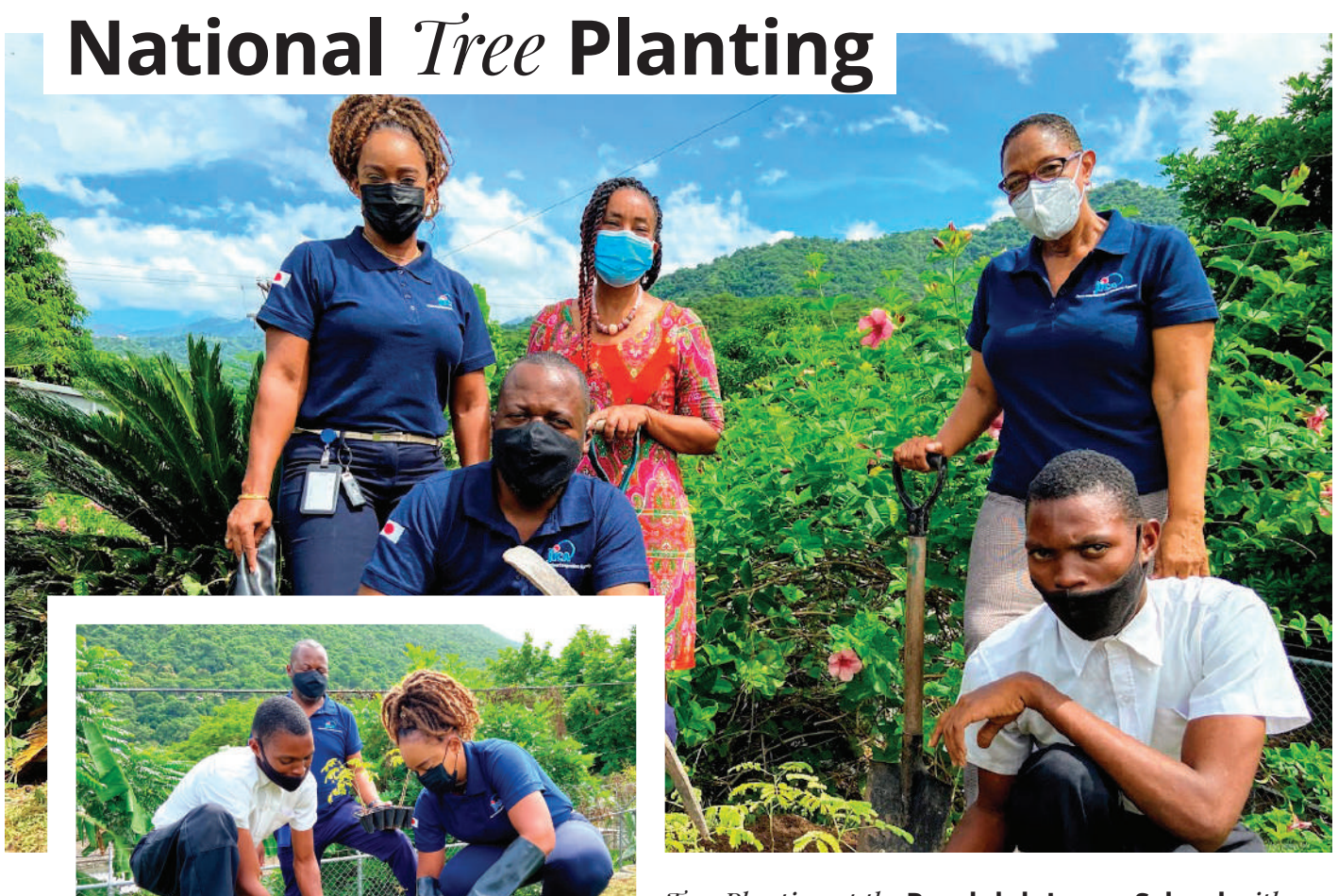
Tree Planting at the Randolph Lopez School with student, Principal and JAAJ members