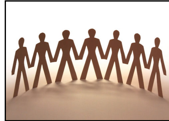
(b) The networker