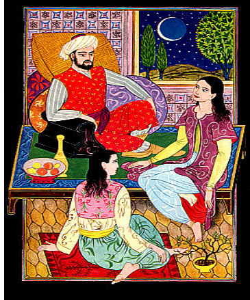
(a) The story-teller